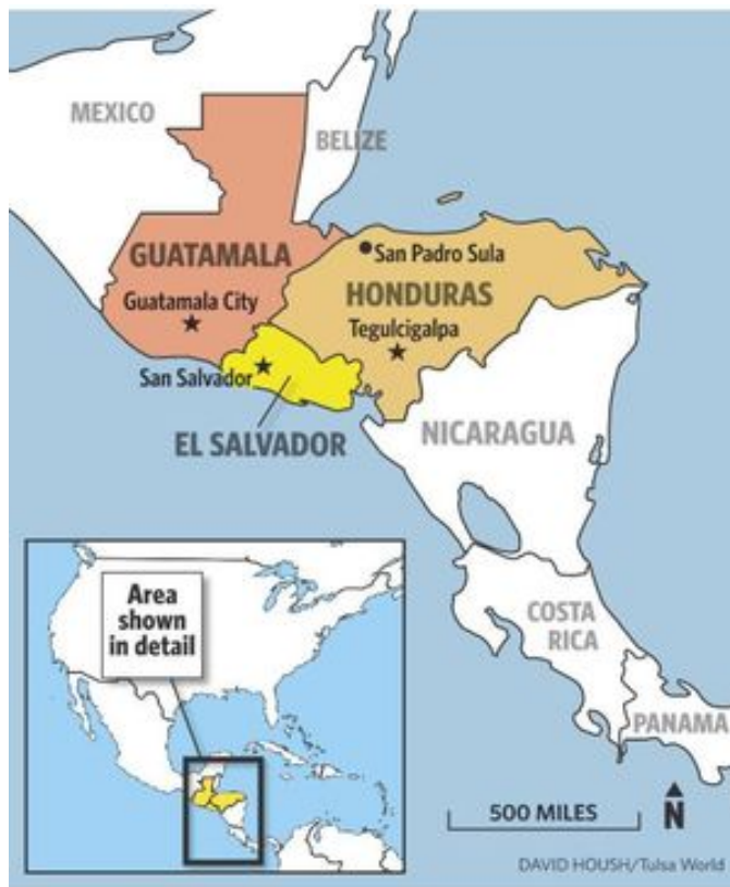
Figure 1. Central America and the Northern Triangle 41

The violence that the region is known for is brought on by many factors. Each of the countries in the Northern Triangle shares common vulnerabilities that must be taken into account when discussing the high levels of violence in the region. According to the United Nations Office on Drugs and Crime, the five main vulnerabilities are “geographic vulnerabilities, demographic, social, and economic vulnerabilities, limited criminal justice capacity, a history of conflict and authoritarianism, and displacement and deportation.” 42 On top of these vulnerabilities, the notorious street gangs, Mara Salvatrucha 13 (MS-13) and the 18th street gang, are the cause of many homicides and violent acts. Homicide rates have remained high in recent years (Figure 2) and remained