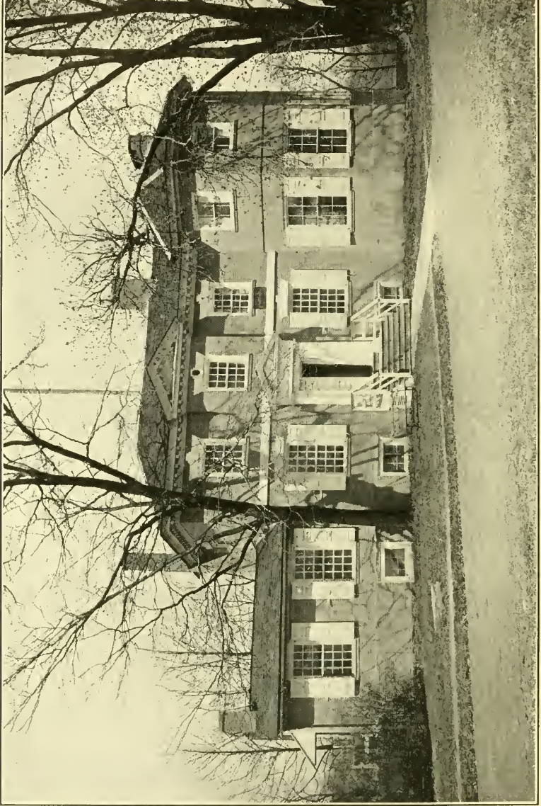
LAUREL HILL NOW KNOWN AS THE RANDOLPH MANSION, EAST FAIRMOUNT PARK, PHILADELPHIA FRONT VIEW FACING EAST