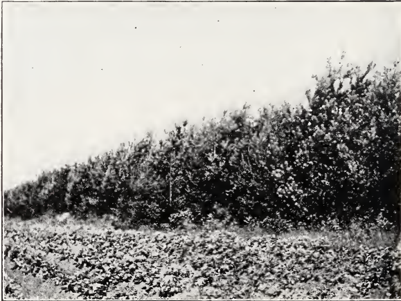
A Serviceable Windbreak

PRINCEPINE, scarlet with white blotch at the throat, showing more open blooms than Princeps