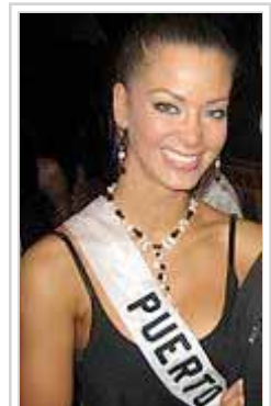
veinticinco años – 25 years