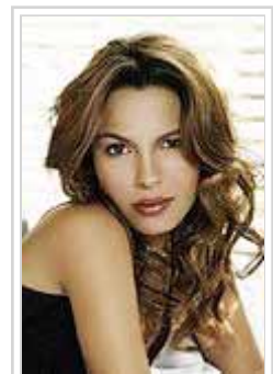
treinta años – 30 years