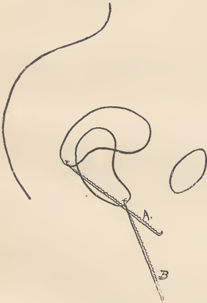
Position A.—Tenaculum caught in cervix. Position B.—Uterus drawn down into vagina.

vaginal palpation, cannot per se establish a diagnosis of pelvic inflammatory disease.