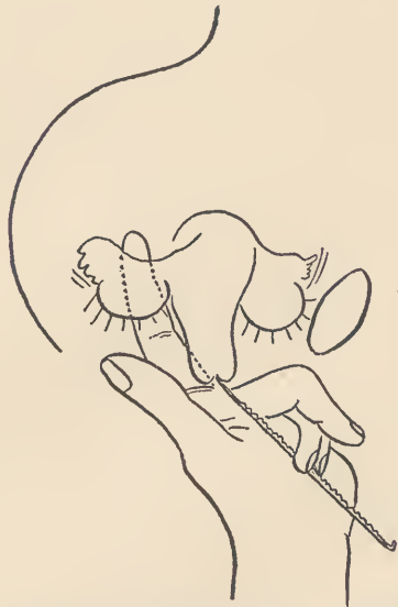
Utero-ovarian ligament used as a landmark in locating ovary. All surfaces of ovary brought into easy touch by means of corrugated tenaculum.

(5) For a more delicate appreciation of the exact condition of the pelvic organs, and in many cases in order to make any diagnosis at all, a bimanual examination by rectum and abdomen under anæsthesia is necessary.