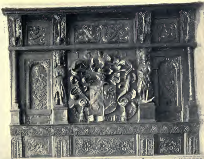
CHIMNEY-PIECE IN COLLEGE FARM, PURTON.