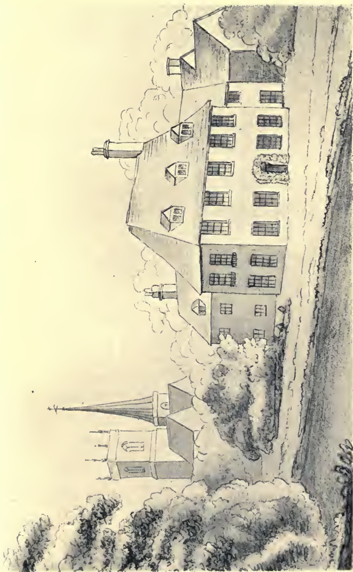
PURTON HOUSE, 1800.