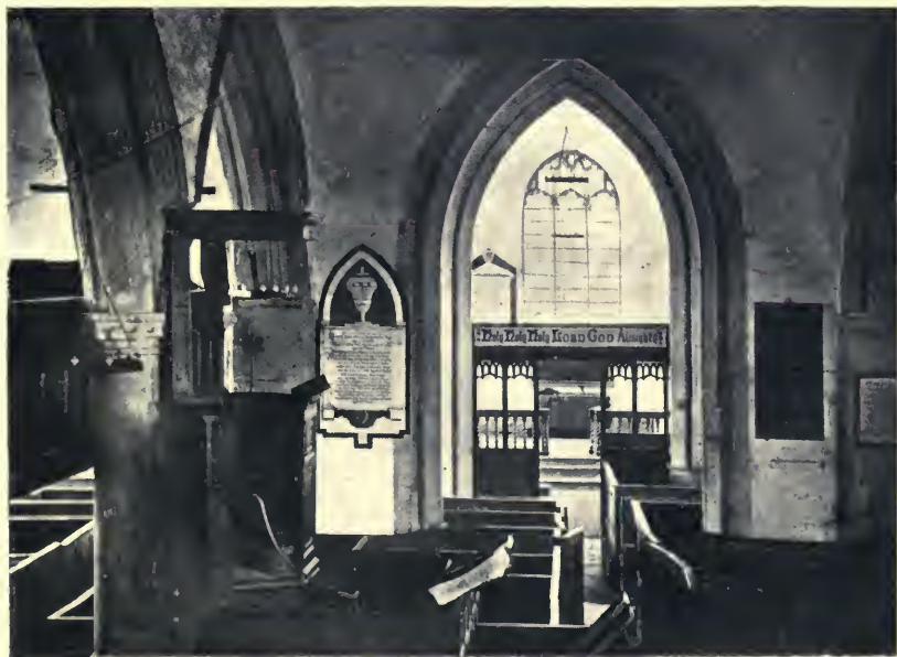
ST. MARY'S CHURCH, PURTON, BEFORE RESTORATION.

(Old print. This pool is now drained away.)