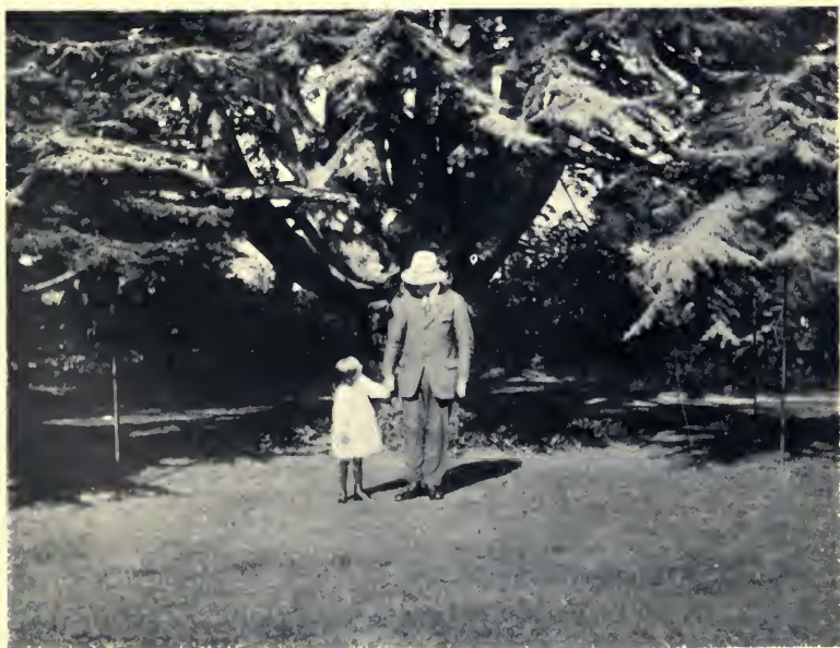
THE GREAT CEDAR, PURTON HOUSE, WILTSHIRE.