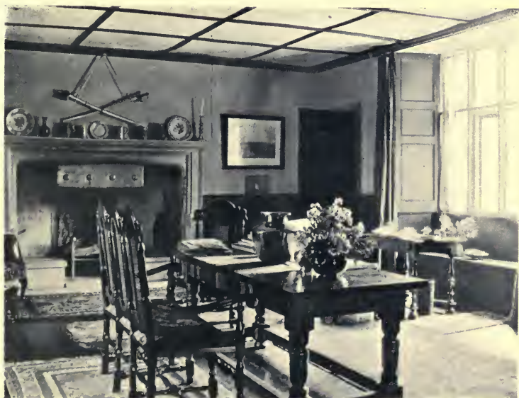
THE HALL, RESTROP HOUSE, PURTON.