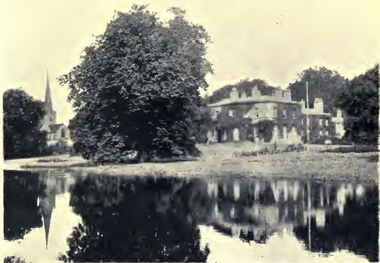
PURTON HOUSE, WILTSHIRE, 1917, FROM "THE GREEN WALK."