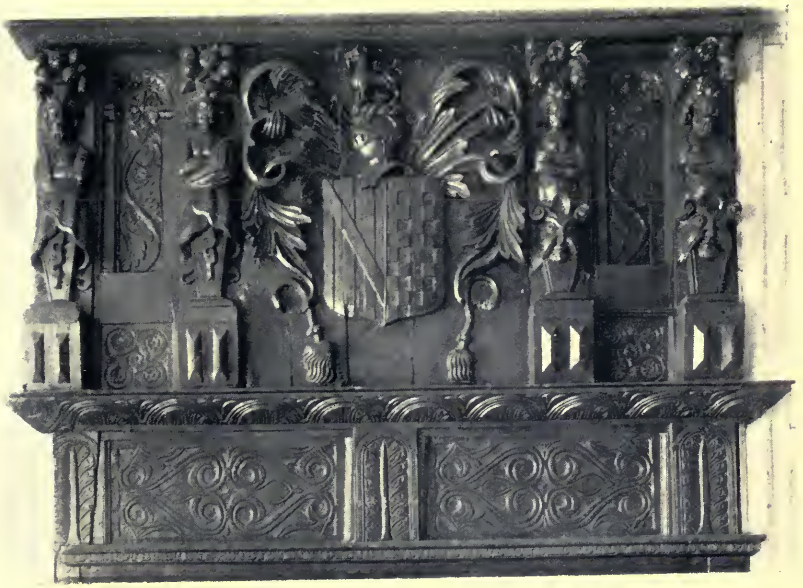
CHIMNEY-PIECE IN COLLEGE FARM, PURTON.