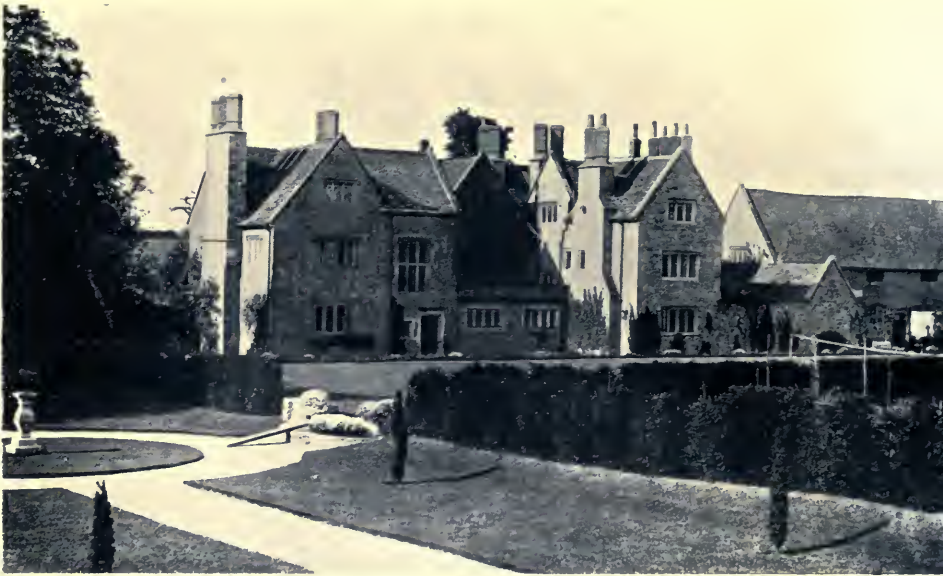
THE MANOR HOUSE, PURTON, NORTH FRONT, LOOKING SOUTH-WEST.