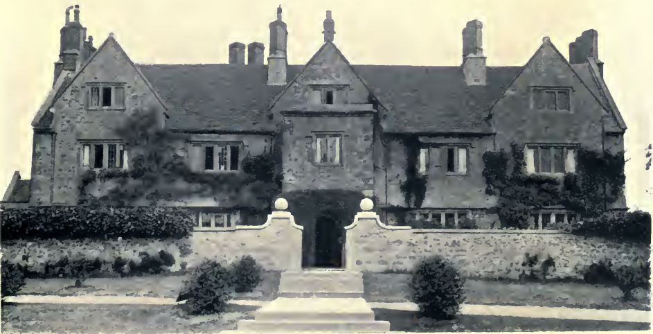
THE MANOR HOUSE, PURTON, SOUTH FRONT.