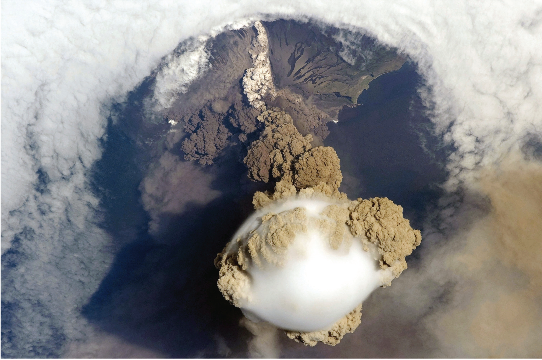
Sarychev Peak Volcano erupting on June 12, 2009, on Matua Island