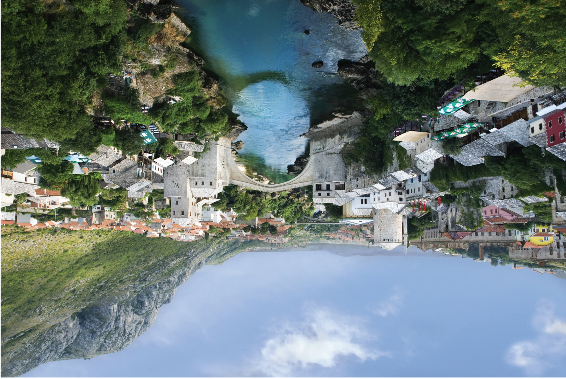
Mostar, Bosnia and Herzegovina - Old Town panorama. The picture was taken from the minaret of Koski Mehmed Pasha Mosque, which is just opposite Stari Most ("The Old Bridge") looking on the same part of the Neretva river.

User:Ramirez Second place, 2010 CC-BY-SA 3.0 and GFDL 1.2+