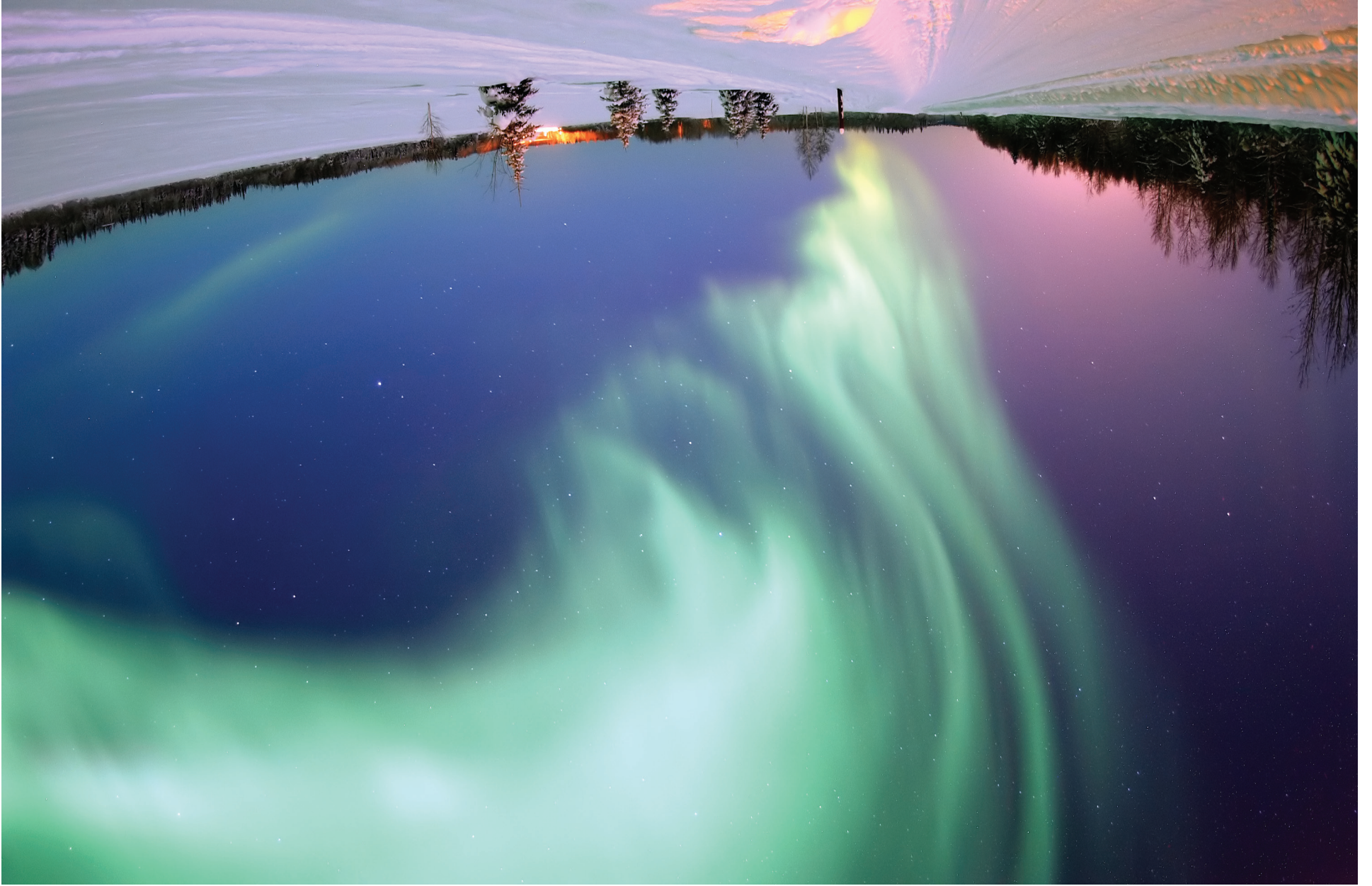
The Aurora Borealis, or Northern Lights, shines above Bear Lake, Eielson Air Force Base, Alaska