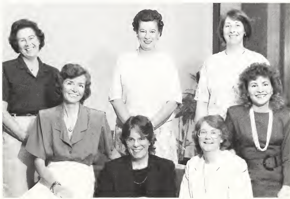
Nursing Department Leadership