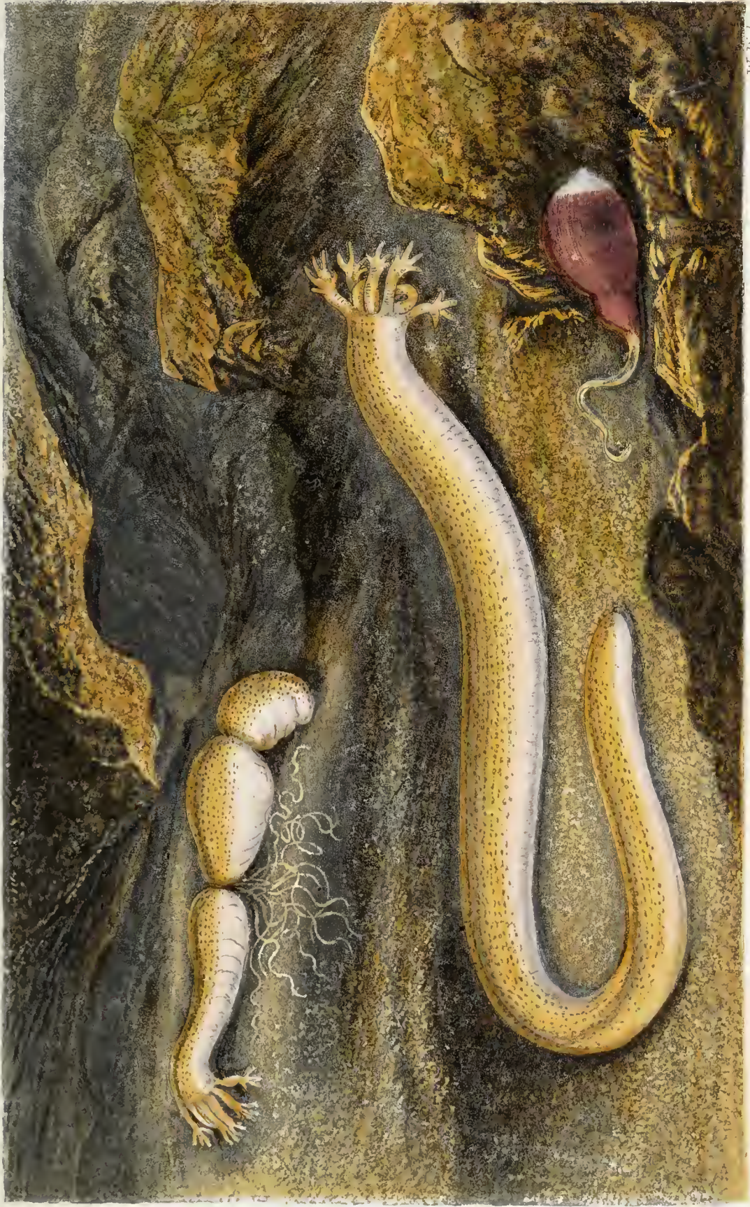
2. TELALASSIMA NEJTUNI