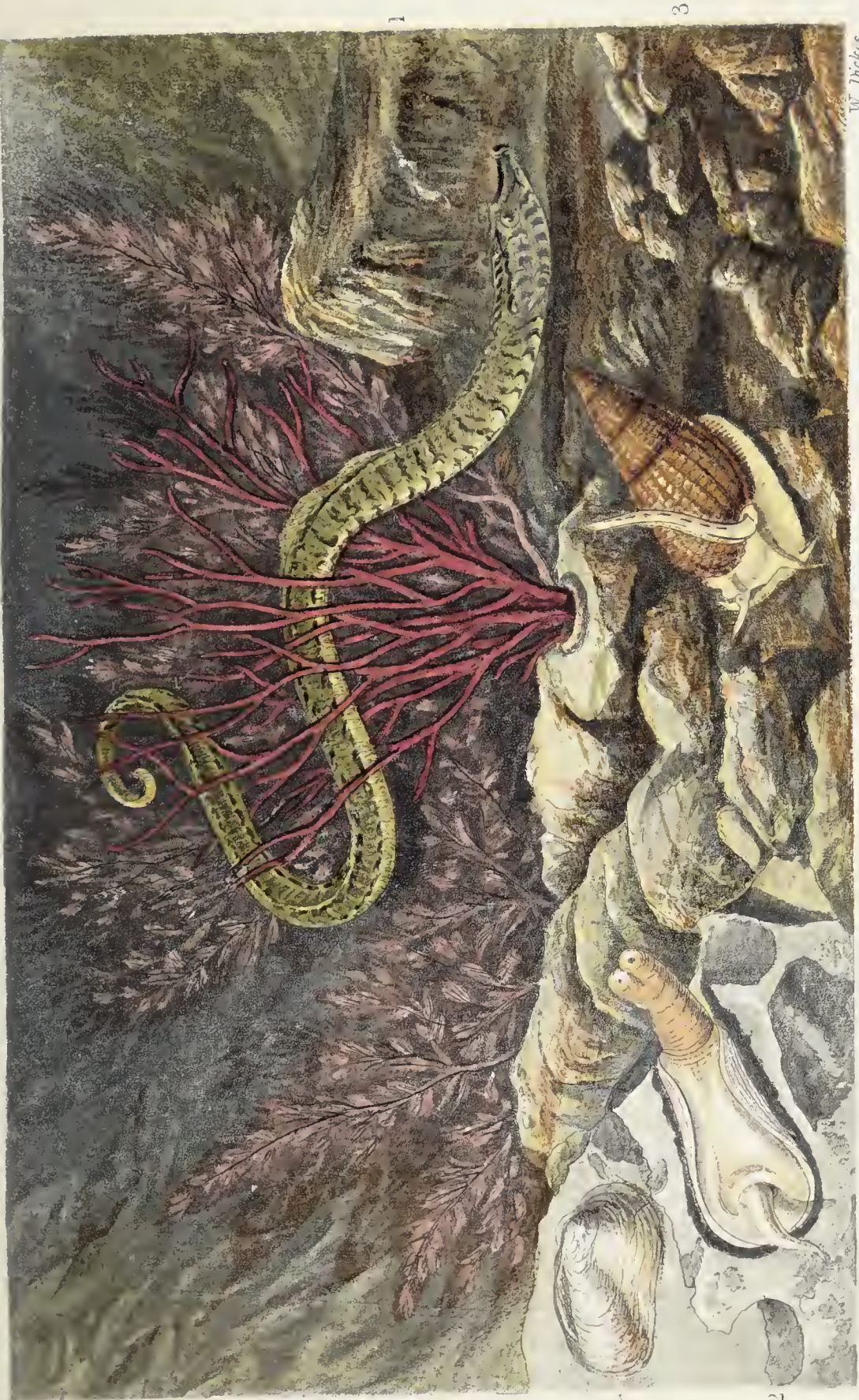
1. SYNGNATHUS LUMBRICIFORMIS.