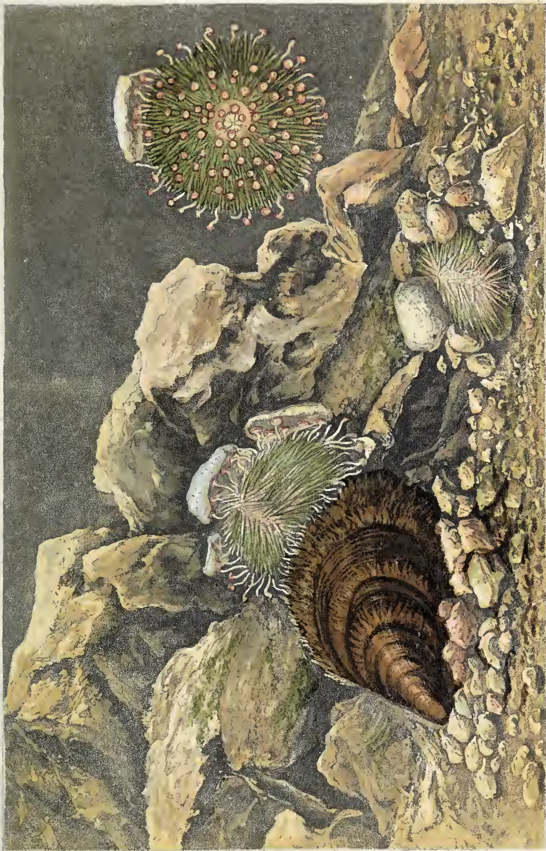
1. ECHINUS MILIARIS, creeping over Motiola barbata 2. 100 100 creeping up the glass. 3. 100 100 hiding under stones.