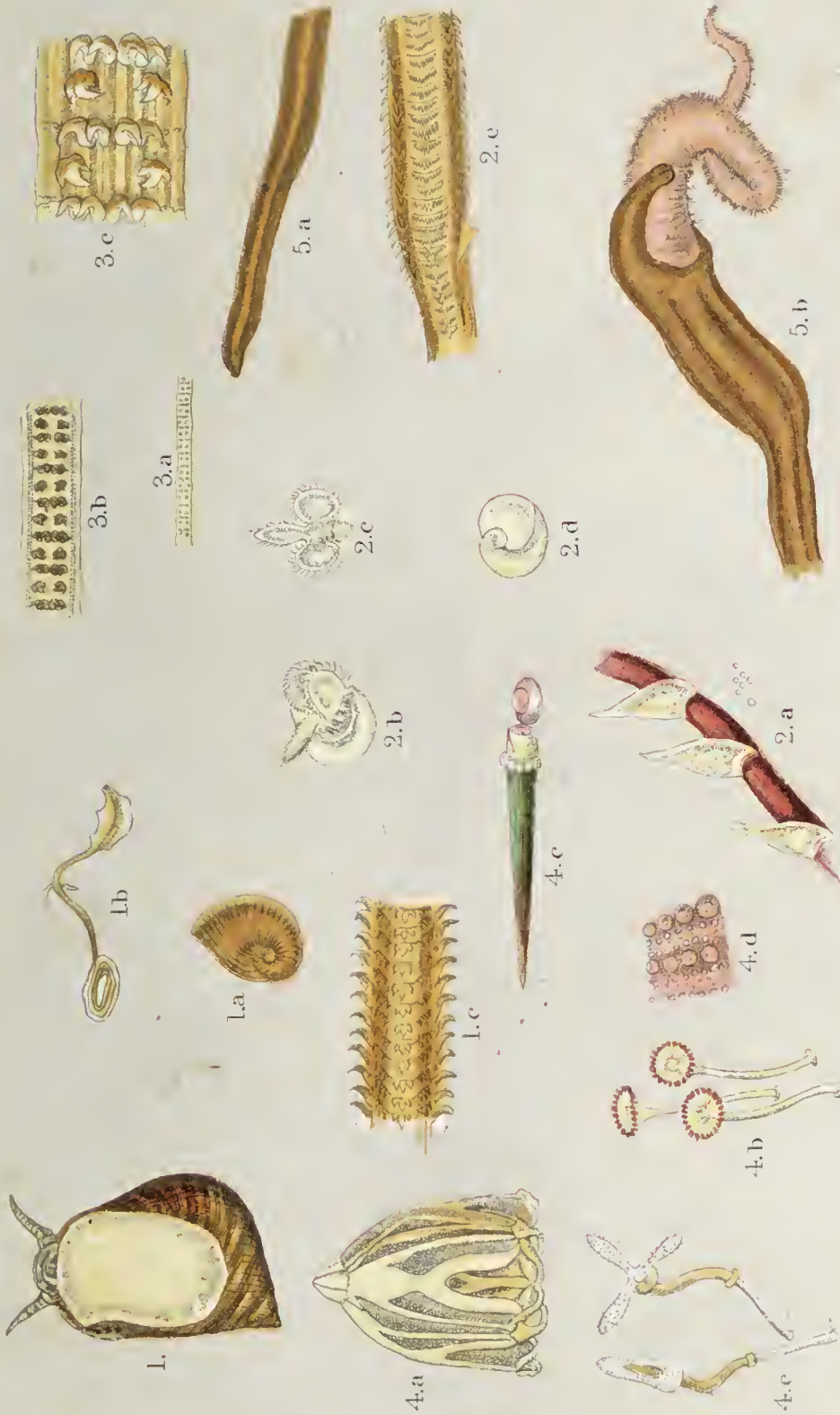
1. LITTORENA LITTOREA. See Plate 9. a. operculum. b. pedicel. c. part of pallet, magnified. 2. NASSA RETICULATA. See Plate 11. a. egg capsules. b. c. fry. d. shell of fry. e. pallet, magnified.