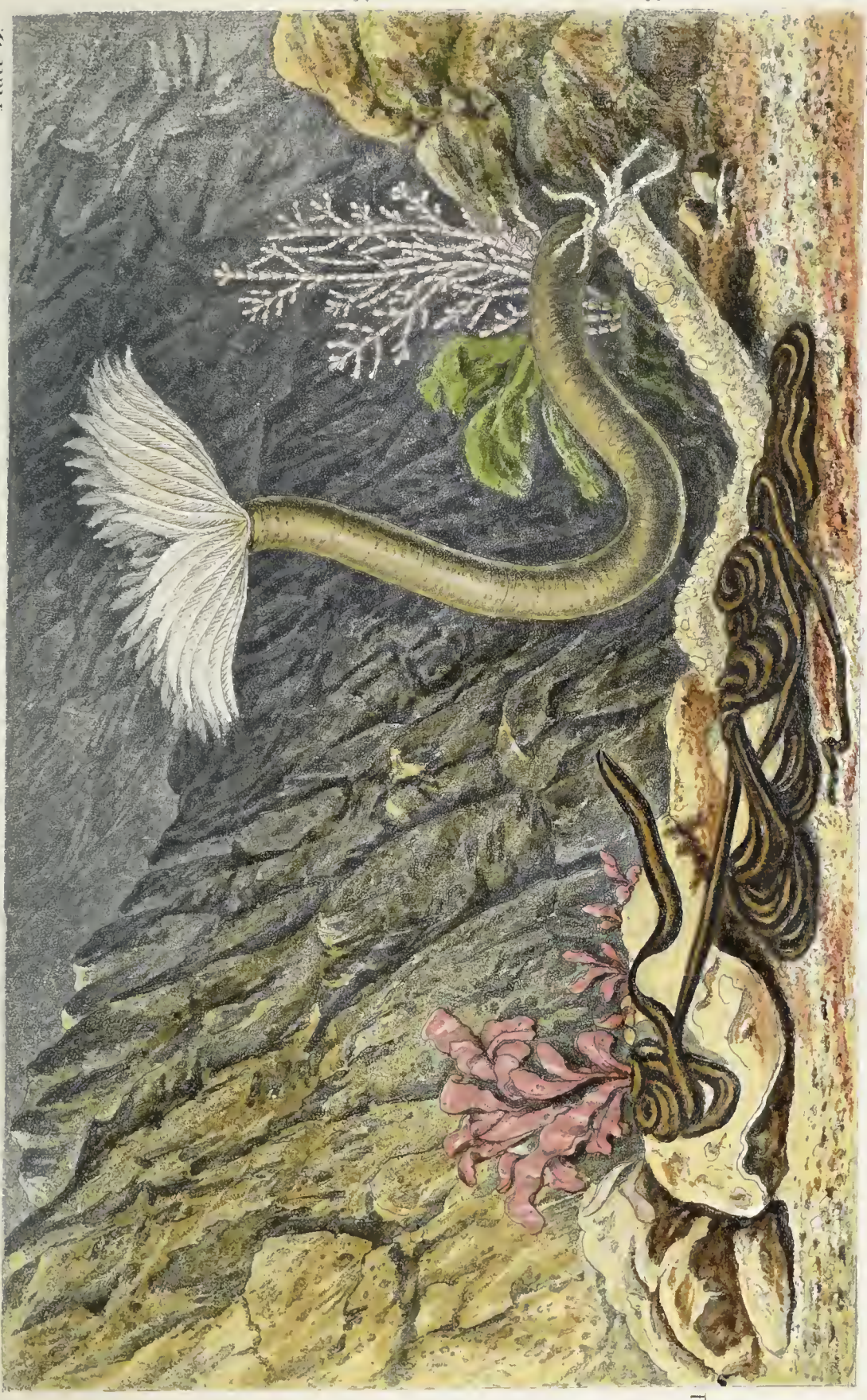
1. NEMERTES BORLASHI. 2. SABELLA ?