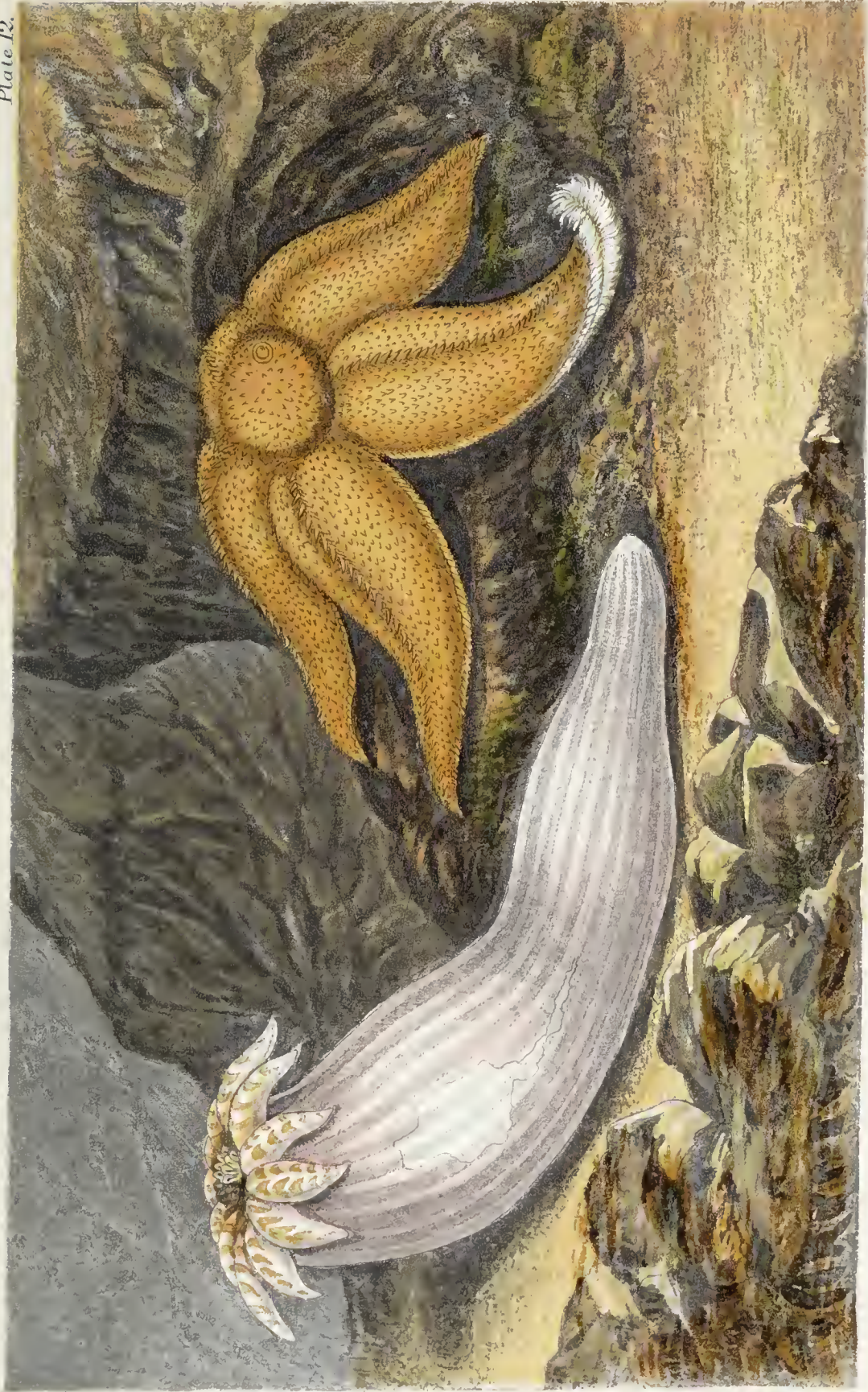
1. PEACHIA HASTATA.