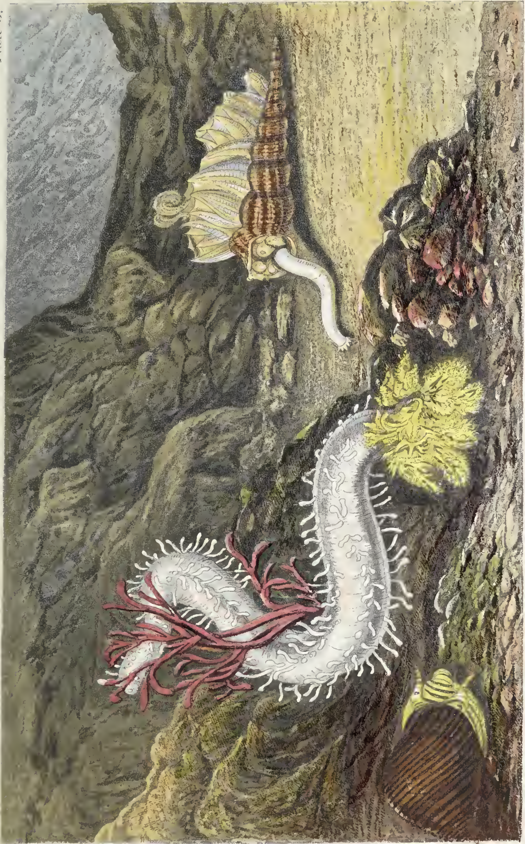
1. CUCUMARIA HYNDMANNI.