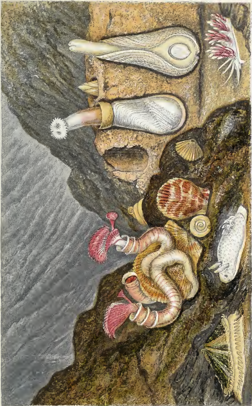
1. SERPULA CONTORTUPLICATA.