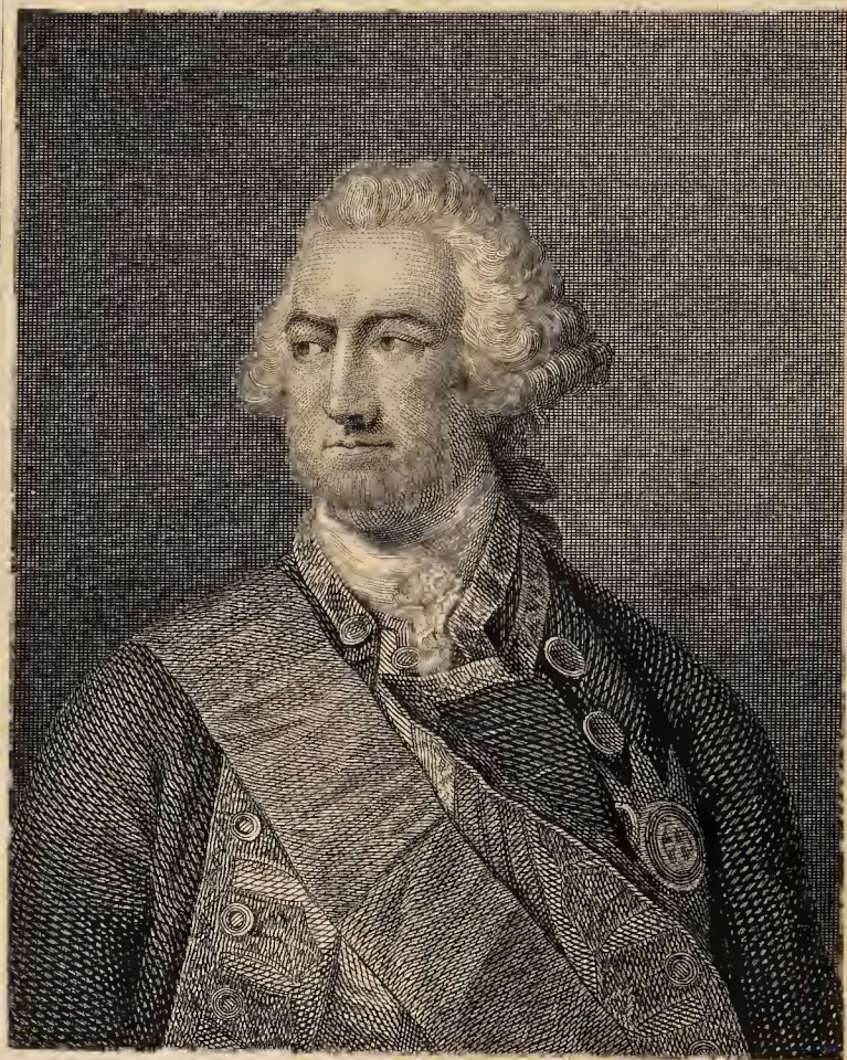
THE RIGHT HON LORD HAWKE, Vice Admiral of England?