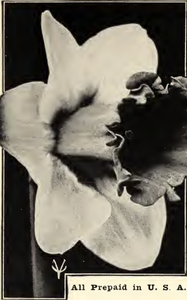
All Prepaid in U. S. A.