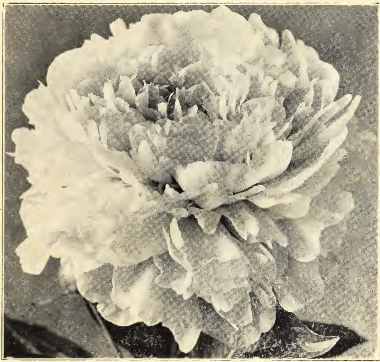
Lovely New Colorado Peony

MAJESTIC. (Andrews.) Flowers of largest size, on strong stems. A perfect rose-type, expanding freely, with no tight buds. Color rose-pink of even tone with a rich fragrance. A sure and profuse bloomer and establishes quickly. $5.00 each.