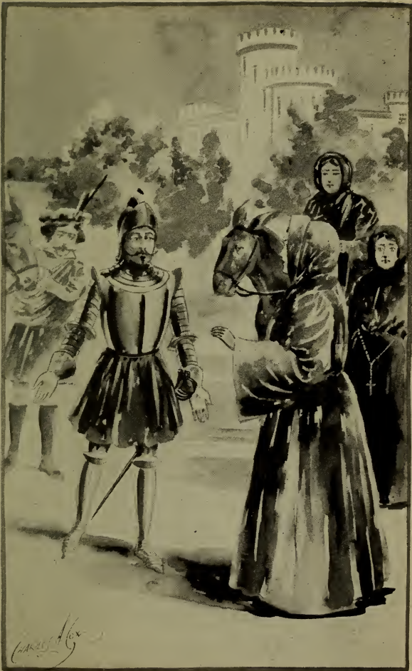
“The startled Abbess loud exclaimed.”—Page 159. Marmion.