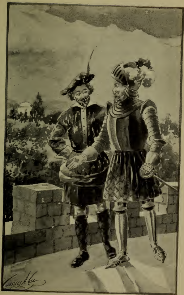
"That on the battlements they walked."—Page 110. Marmion.