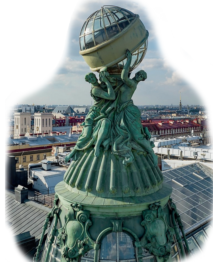
Singer company building, Saint Petersburg