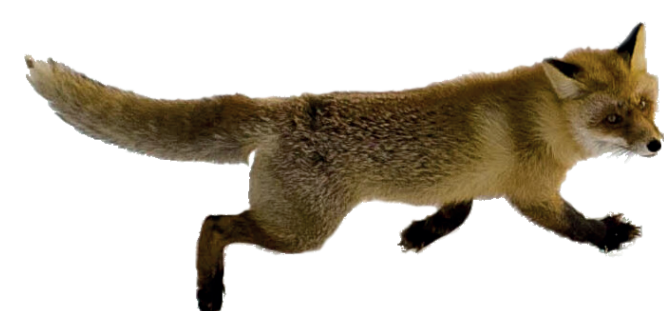
Fox in a snowy field, Chudovsky district, Novgorod Oblast

Lists of Cultural Heritage Monuments Improving & creation Wikipedia articles