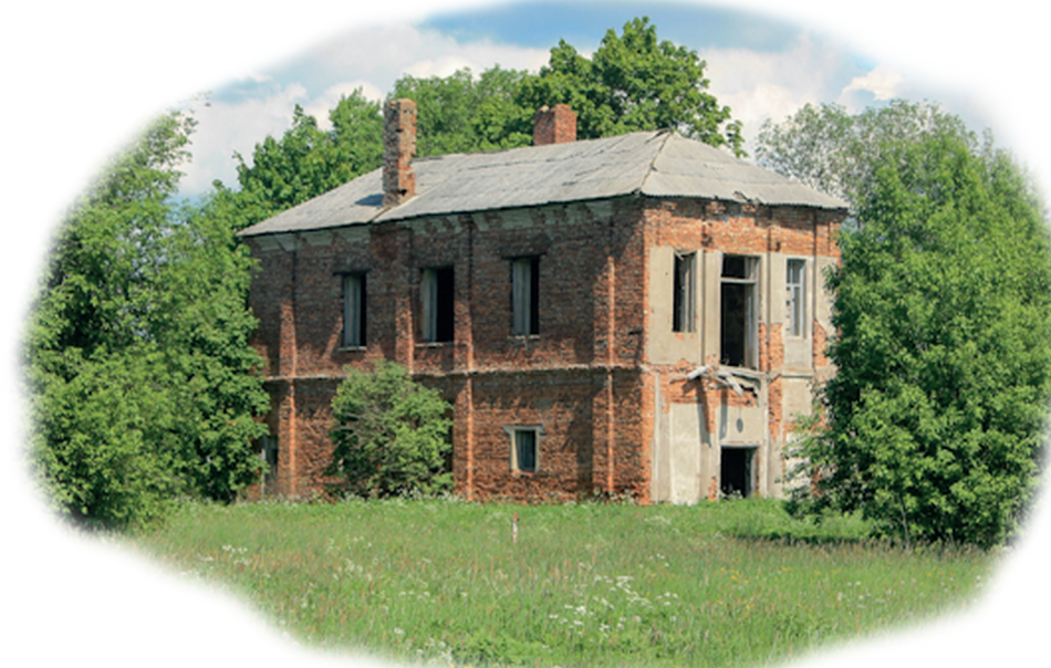
Lomakha, Lomonosovsky District, Leningrad Oblast