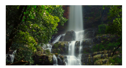
Sujay loves taking photographs of the greenery around Pune