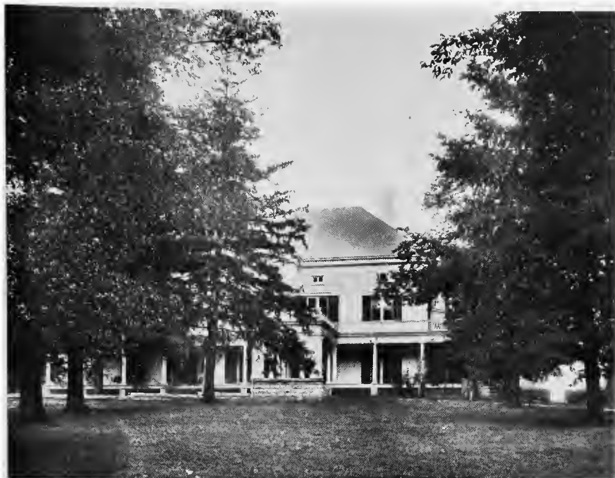
A CORNER OF "MANSFIELD"—HOME OF HENRY WATTERSON