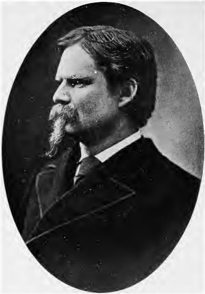
HENRY WATTERSON—FIFTY YEARS AGO