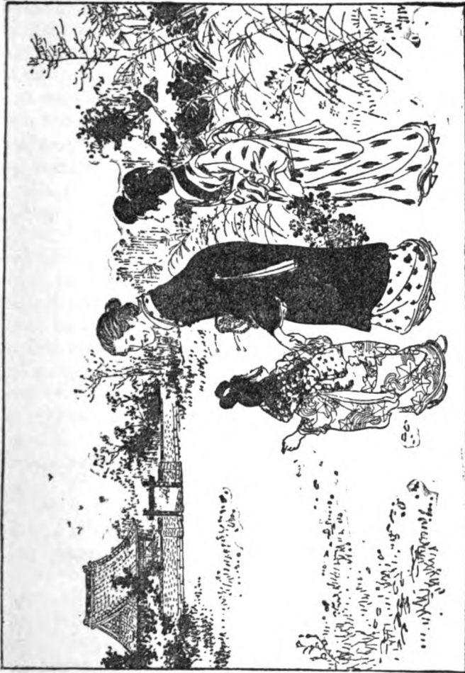
During these months, my greatest pleasure was going to the temple with Mother. Toshie, the maid, always walked behind, carrying flowers for the grave.