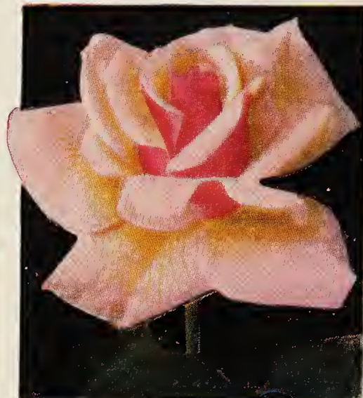
EDITH NELLIE PERKINS