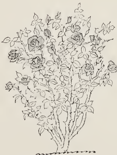
The result of high pruning. Bare legs—tall growth.