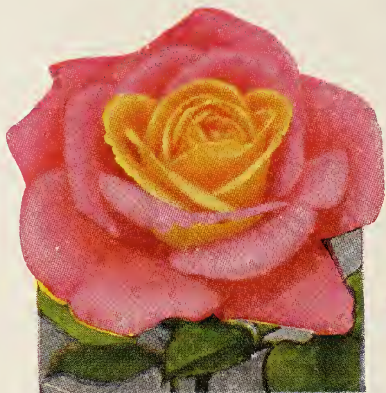
PRES. HERBERT HOOVER