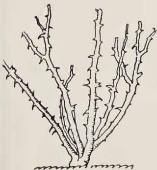
A Hybrid Tea Rose pruned high in spring.