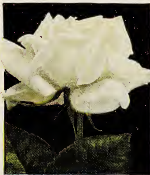
KAISERIN AUG. VIKTORIA