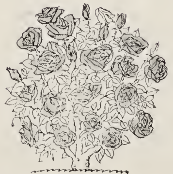
Result of close pruning. Low, compact—large flowers.