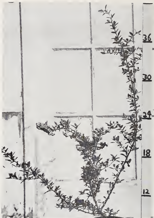
Pyracantha lalandi 1 gal. can