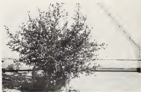
Pyracantha Coccinea Lindleyana - page 9

2 to 2½ ft. spread 4.00 3 to 3½ ft. spread 7.00 2½ to 3 ft. spread 6.00 3½ to 4 ft. spread 8.00