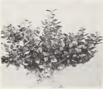
Ligustrum lucidum - (wax or blackleaf)