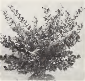
Ligustrum lucidum recurvifolium