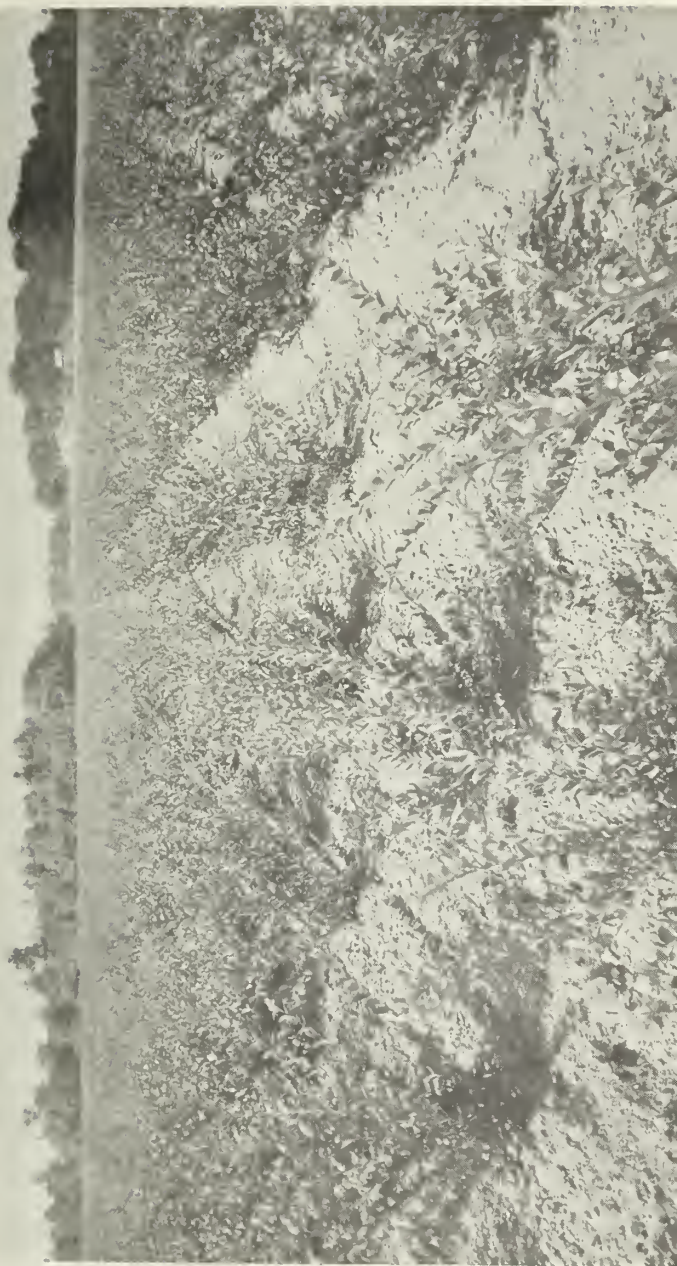
Typical field of Ligustrum lucidum 7500 in this block