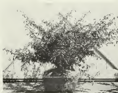
Pyracantha Yunnanensis - See Page 10