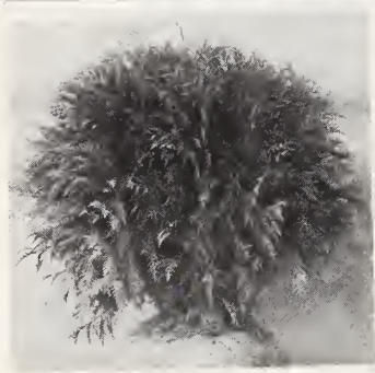
Above Hovey's Arborvitae