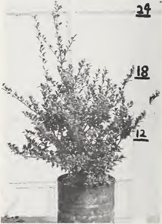
Ilex convexa - 1 gal. can