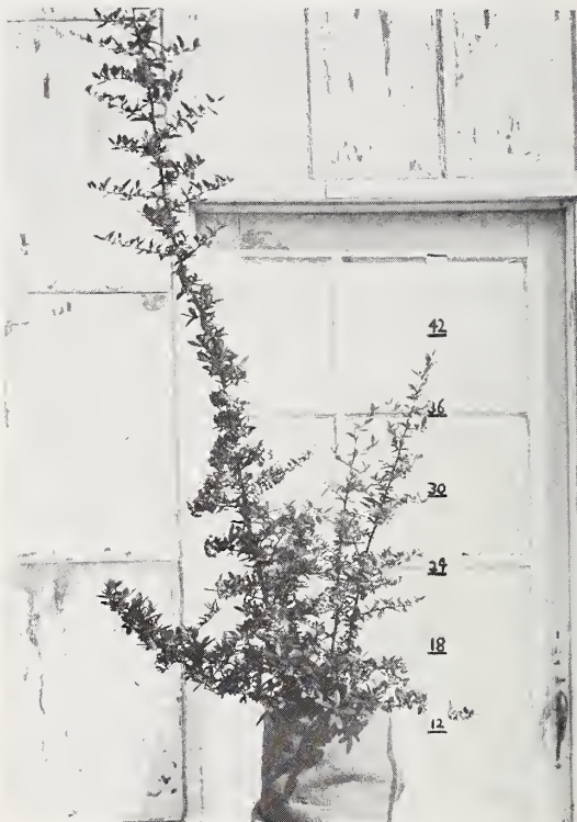
Pyracantha lalandi 4 gal. can