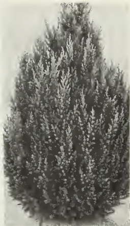
Spiny Greek Juniper

JUNIPERUS communis hibernica . Compact, narrow, upright growth. Irish Juniper.