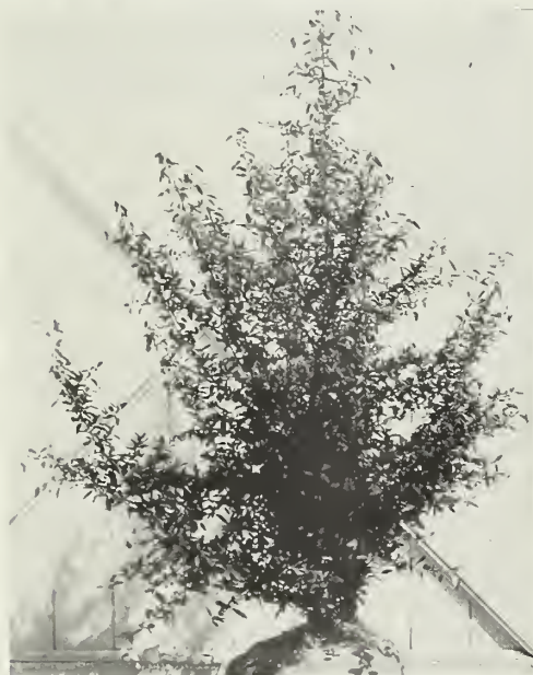
Pyracantha Lalandi - See page 10