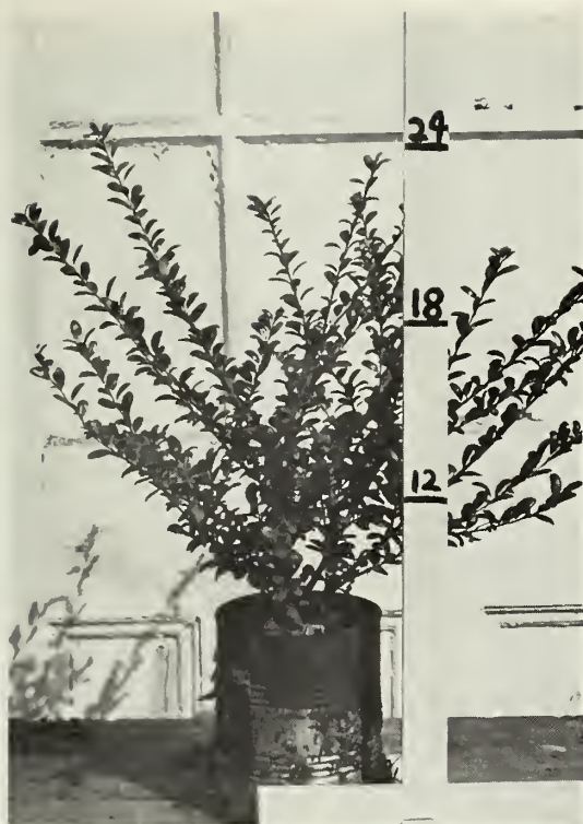
Ilex crenata hetzi 1 gal. can