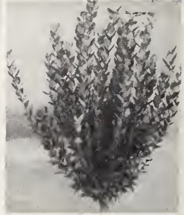
Ligustrum lucidum - nobilis