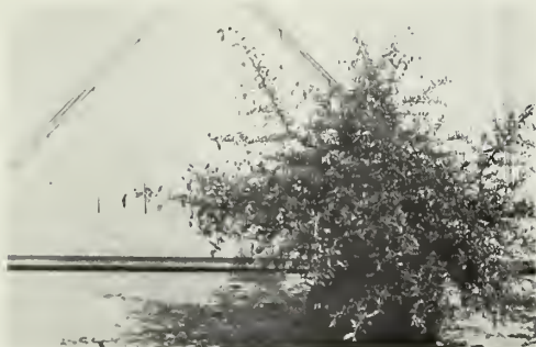
Pyracantha Coccinea Paucifolia - See Page 10

2 \frac{1}{4} " pots . . . . . 100 - $30.00 . . . . . .40