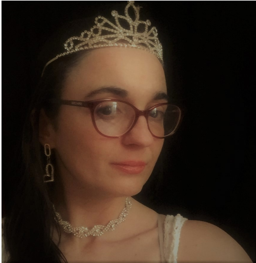
The Queen of Clare and Castile