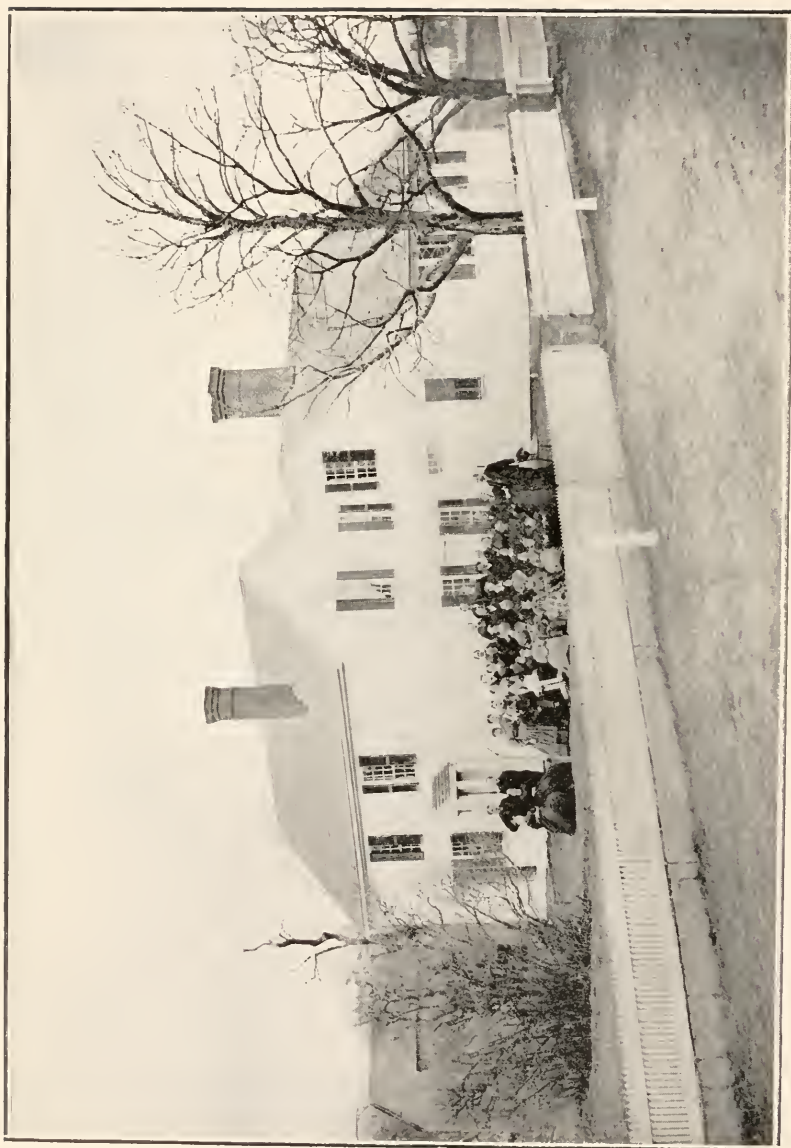
SHUMWAY HOMESTEAD, WEST MEDWAY, MASS. THANKSGIVING DAY, 1866