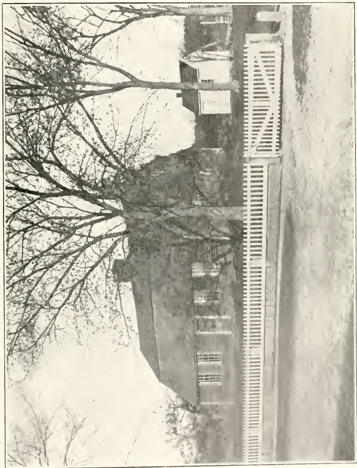
THE JABEZ SHUMWAY HOMESTEAD