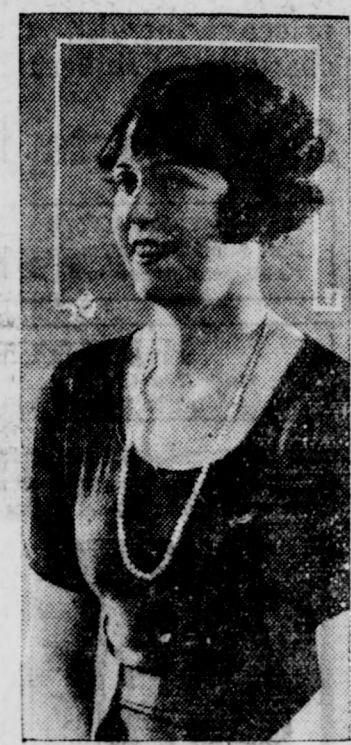
Wavy Hair Has Its Advantages

ARTFULLY WAVED HAIR Wavy hair has so many advantages that no one wavers it is almost universally coveted. It is not universally becoming. That's what I want to impress upon more than half the straight-haired girls who write me for hair waving hints. But it's hard to say which type face looks best with straight or waved hair, it's necessary to see the face—and even then, one can judge wrongly. Generally, the dark-haired, tall, sedate type looks nicest with straight hair; beyond that, generalities are impossible. But there are many times when any soft wave is better than straight locks. For instance, if you are tired and your very features seem "draggy," then waved