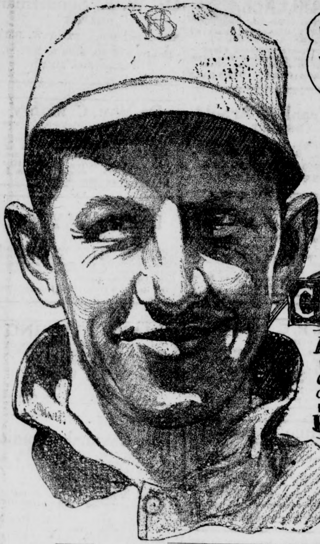
WE GOTTA HAVE COLLINS IF YA EXPECT THIN ANOTHER PENNANT !!