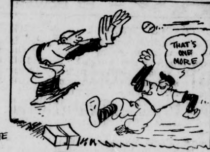
ONE OF THE GREATEST SACK SWIPERS IN ALL BASE BALL

THE YANKS ARE HOT AFTER EDDIE THEY NEED A MAN WHO CAN YANK TO LEAD THE INFIELD