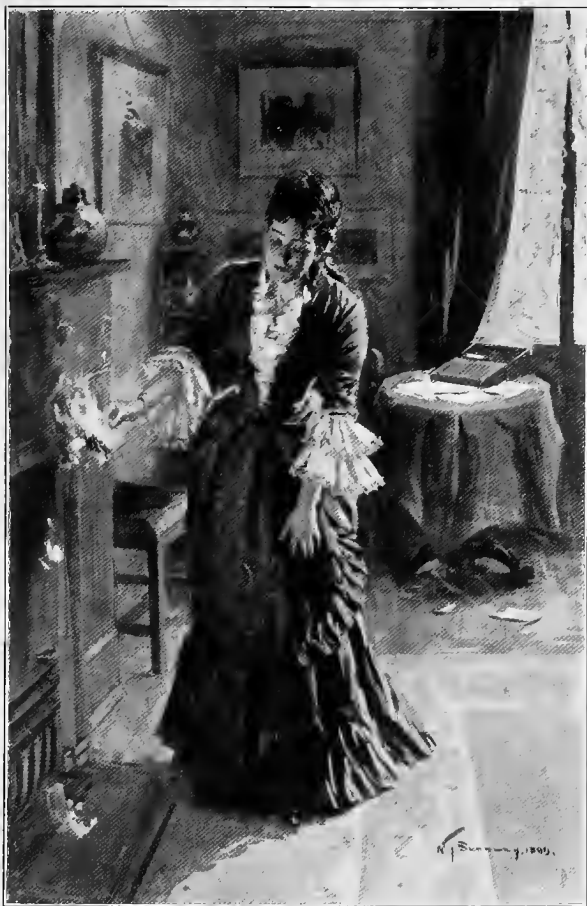
EACH LETTER SLOWLY CONSUMED TO ASHES