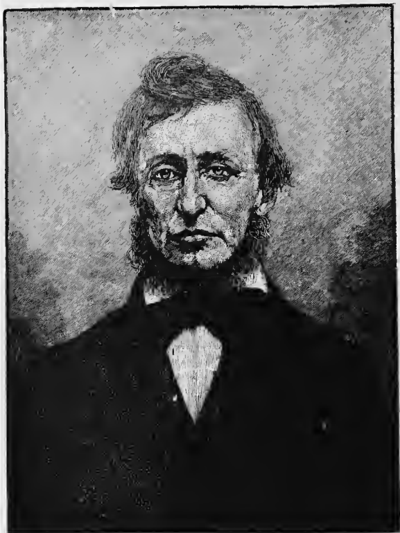
HENRY D. THOREAU.