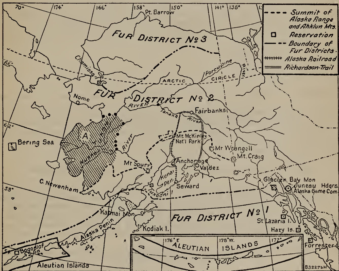
FIGURE 2.—Map of Alaska, the shaded portion (A) showing the lower Kuskokwim and Yukon drainage in District 2, where the open season on muskrat is May 1 to June 10

Muskrat . 3 —In that part of the district north of the summit of the Alaska Range and Ahklun Mountains consisting of the area south and westerly of a line following the winter trail through Unalakleet, Old Woman, Kaltag, Diskakat, Dikeman, Iditarod, Flat, and Georgetown, thence following the divide separating the streams flowing into the Kuskokwim from the south below Georgetown from those flowing into the Kuskokwim from the south above Georgetown, and extending to the summit of the Ahklun Mountains, May 1 to June 10.