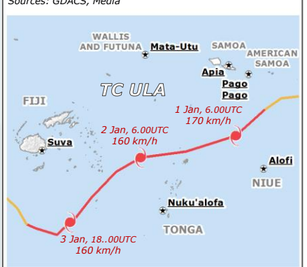
Copyright, European Union, 2016. Map created by EC-JRC. The boundaries and names shown on this map do not imply official endorsement or acceptance by the European Union.