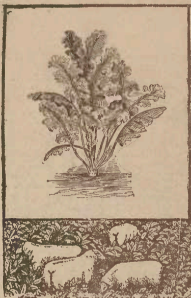
Dwarf Essex Rape, the best pasture and forage plant in existence.