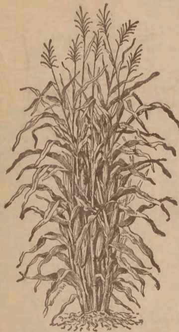
Stowell's Evergreen Sweet Corn.

For Full descriptions and prices see large Catalogue; also condensed price list for 1902 for farm seeds on last page of this supplement.