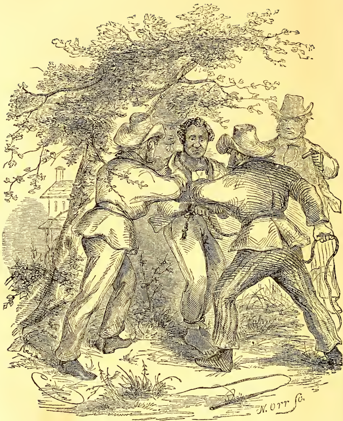
CHAPIN RESCUES SOLOMON FROM HANGING.