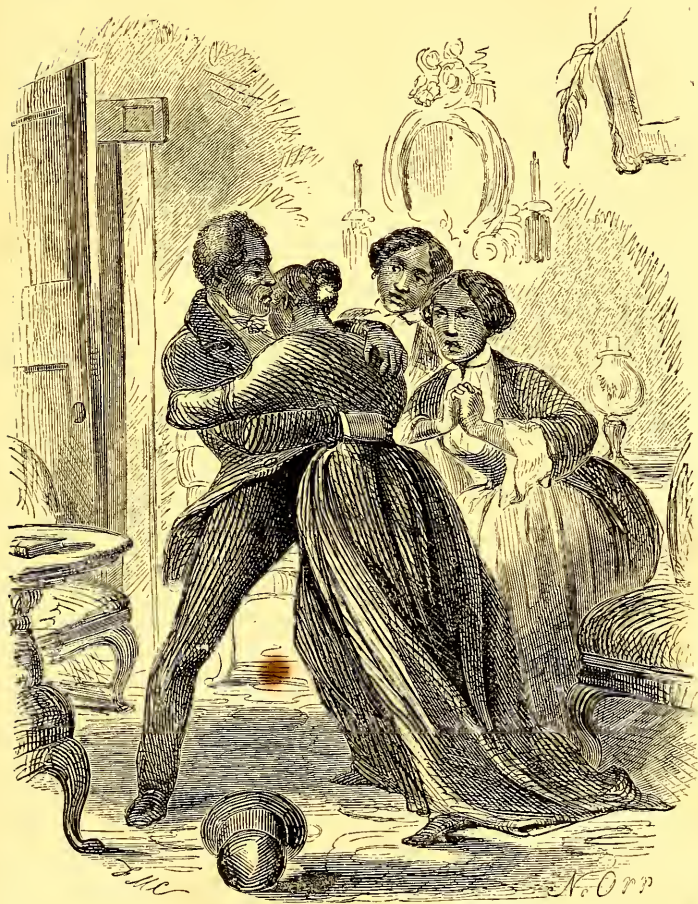
ARRIVAL HOME, AND FIRST MEETING WITH HIS WIFE AND CHILDREN