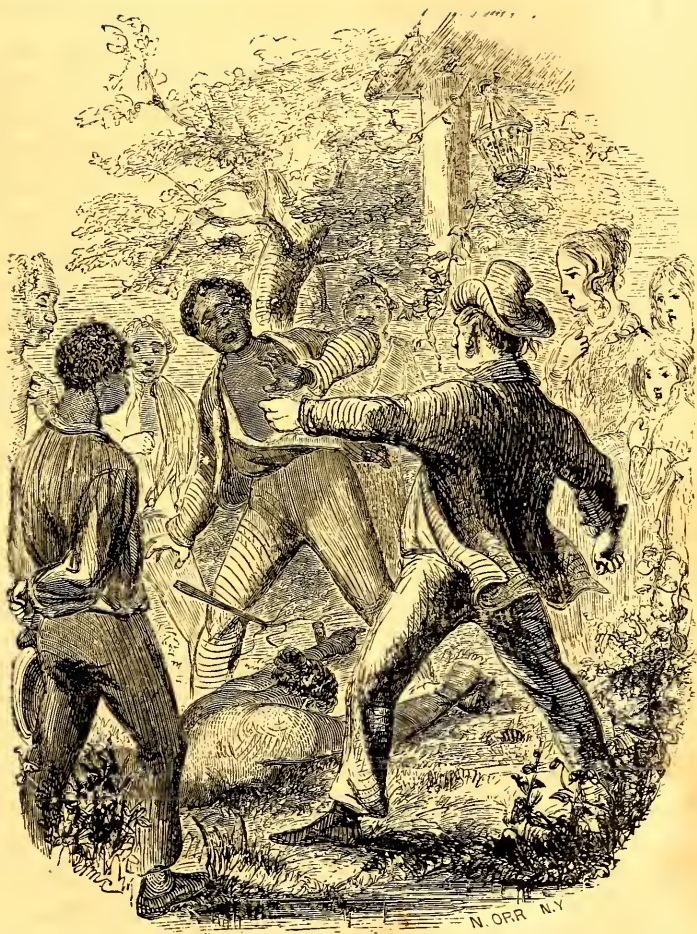
THE STAKING OUT AND FLOGGING OF THE GIRL PATSEY.