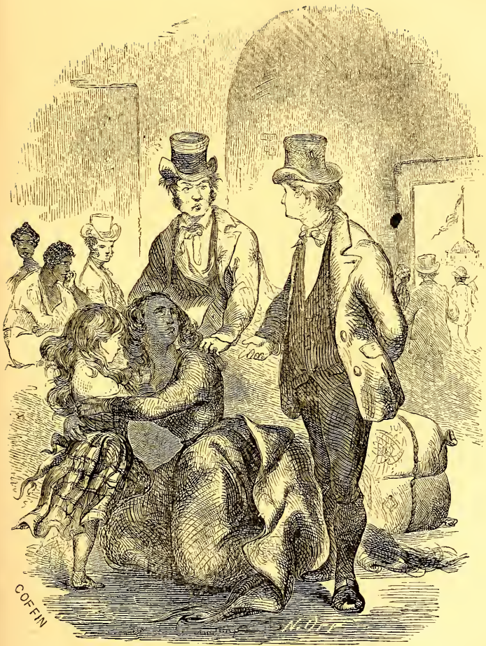
SEPERATION OF ELIZA AND HER LAST CHILD.