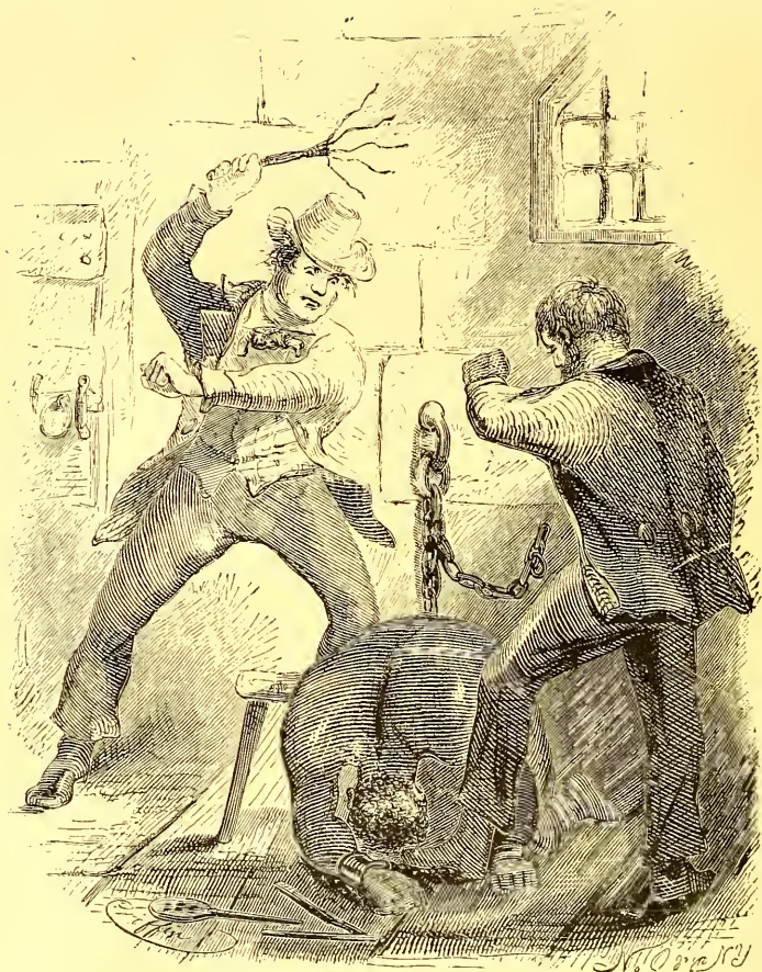
SCENE IN THE SLAVE PEN AT WASHINGTON.