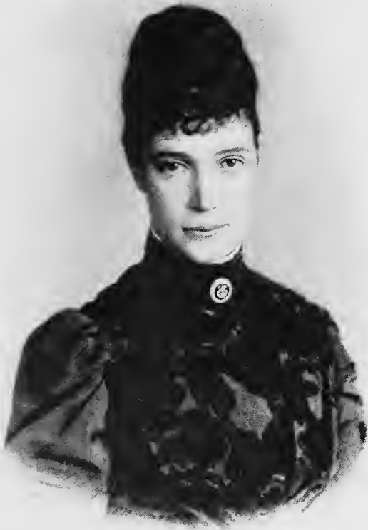
THE DOWAGER EMPRESS MARIE FEODOROWNA