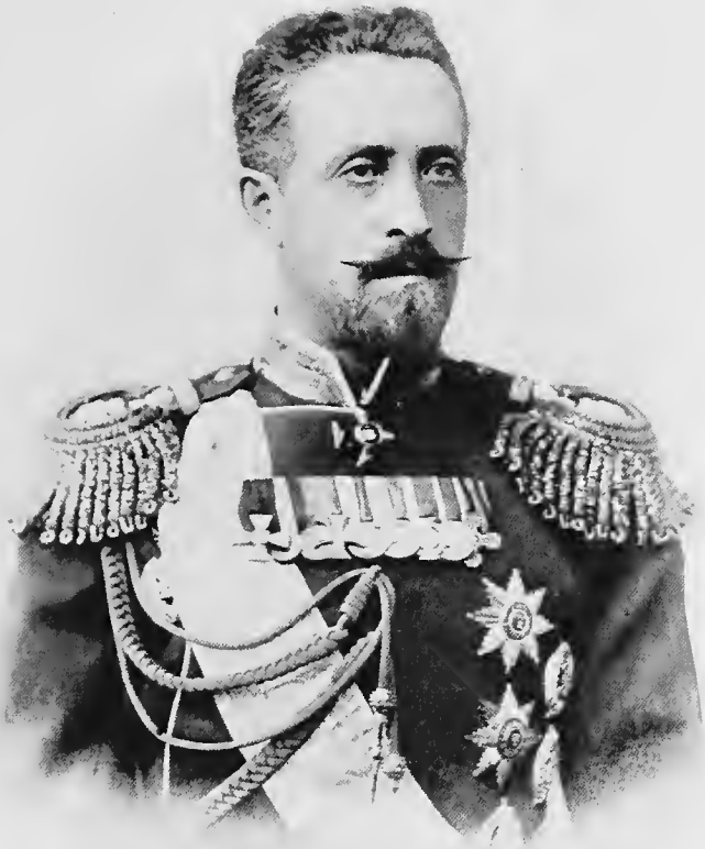
THE GRAND-DUKE NICHOLAS