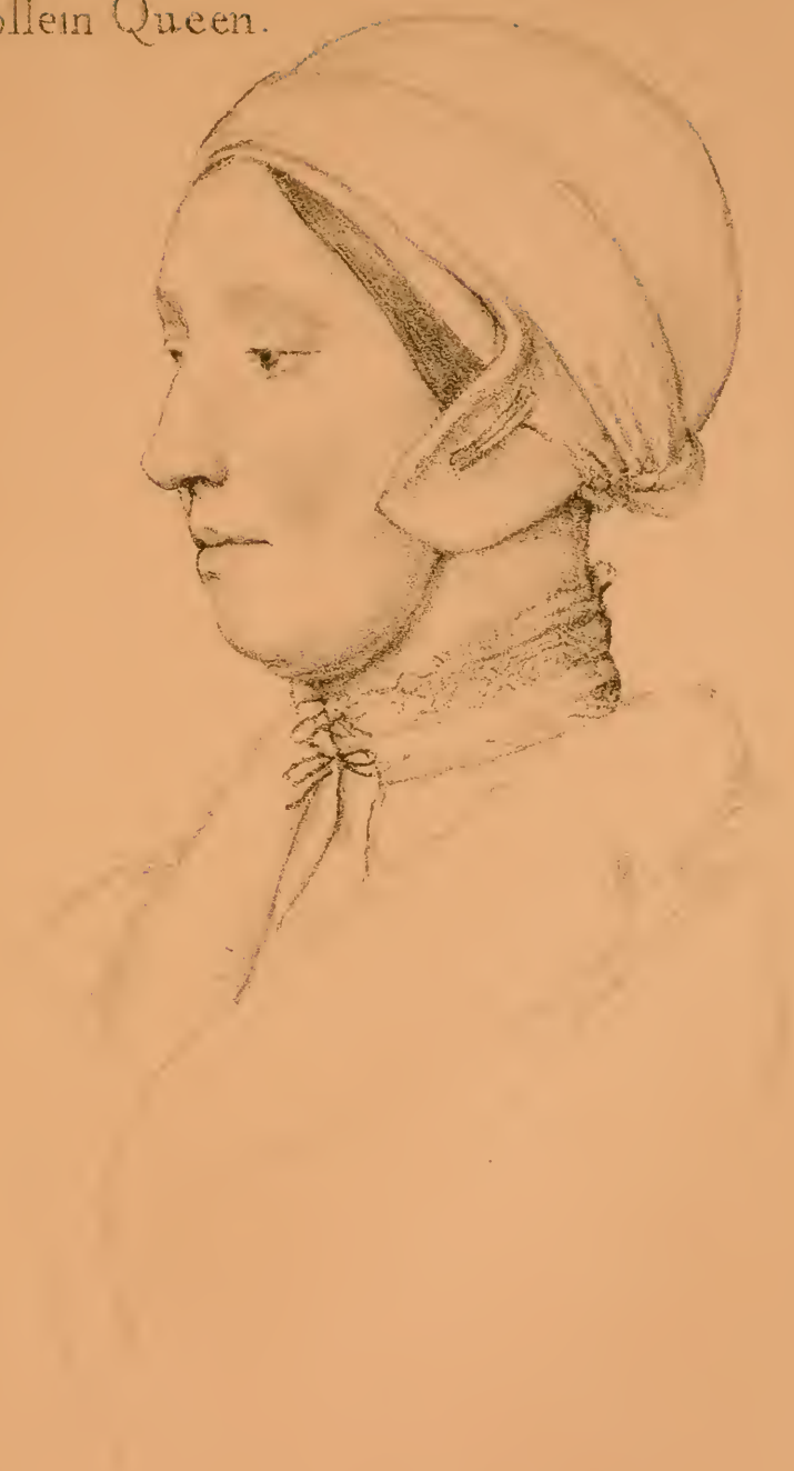
Anna Bollein Queen.