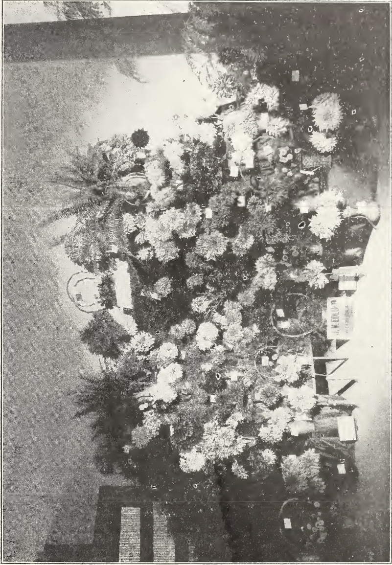
Our exhibit at the Minnesota Dahlia Show Minneapolis, Minn., September, 1930.