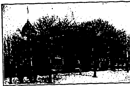
See first page for Commencement notes.

School closes Friday noon for the summer vacation.