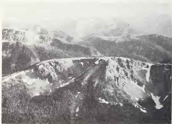
Looking south from near the Canadian Boundary. Quartz Lake in foreground.

The North Cascades Primitive Area is located on the Mt. Baker and Okanogan National Forests. It adjoins the International Boundary between Canada and the United States on the north and extends southward astride the Cascade Mountain Range approximately 20 miles. Elevations vary from about 1,500 feet near the Skagit River to over 9,000 feet at the summit of the highest peaks. The Primitive Area includes