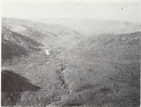
The Pasayten Airfield is 17 miles from the nearest road. Aerial view looking north down Pasayten River. Canada in distance.

Ranger district multiple use plans will be the basis for study of the North Cascades area. Multiple use plans are made for each national forest ranger district. The objective of each plan is to provide management practices to all the various renew-