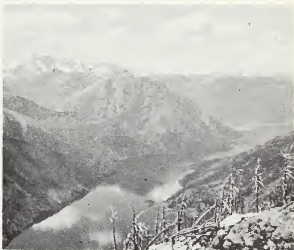
Looking north up Ross Lake from Devils Dome Trail

many forest types and conditions ranging from heavily forested slopes on the lower elevations to alpine meadows, open grasslands, rock barrens, snow fields, and glaciers on the higher peaks. Ross Lake divides the area, stretching from Ross Dam northward into Canada.