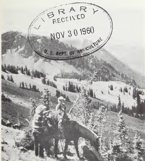
Party pauses on trail overlooking Goat Lake Basin, Mt. Baker National Forest