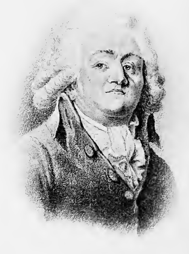
de Comto de Minubeau