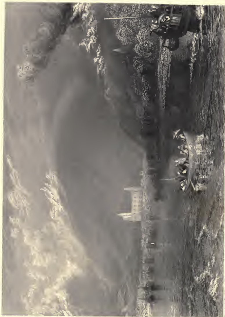
View from the boat, Avonmouth, 1907. H. W. ...