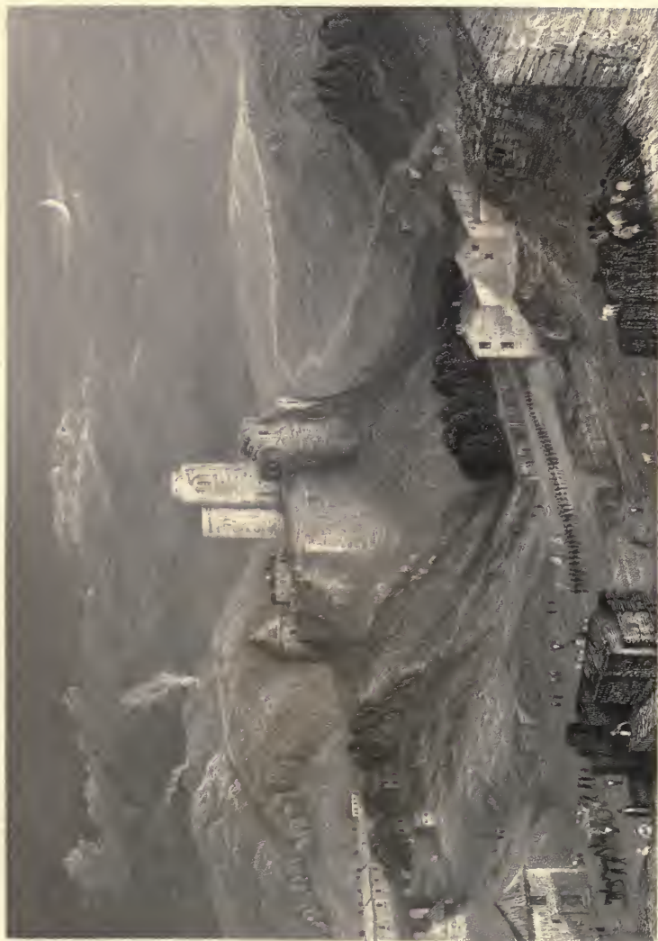
Drawn by J. M. W. Turner. R. A.