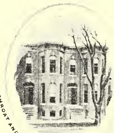
THORAT AND CHEST