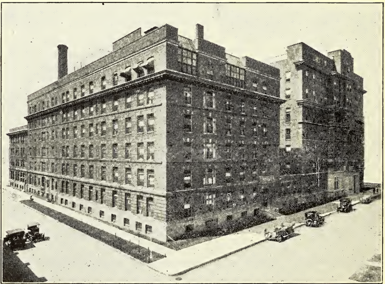
THE PRIVATE PAVILION