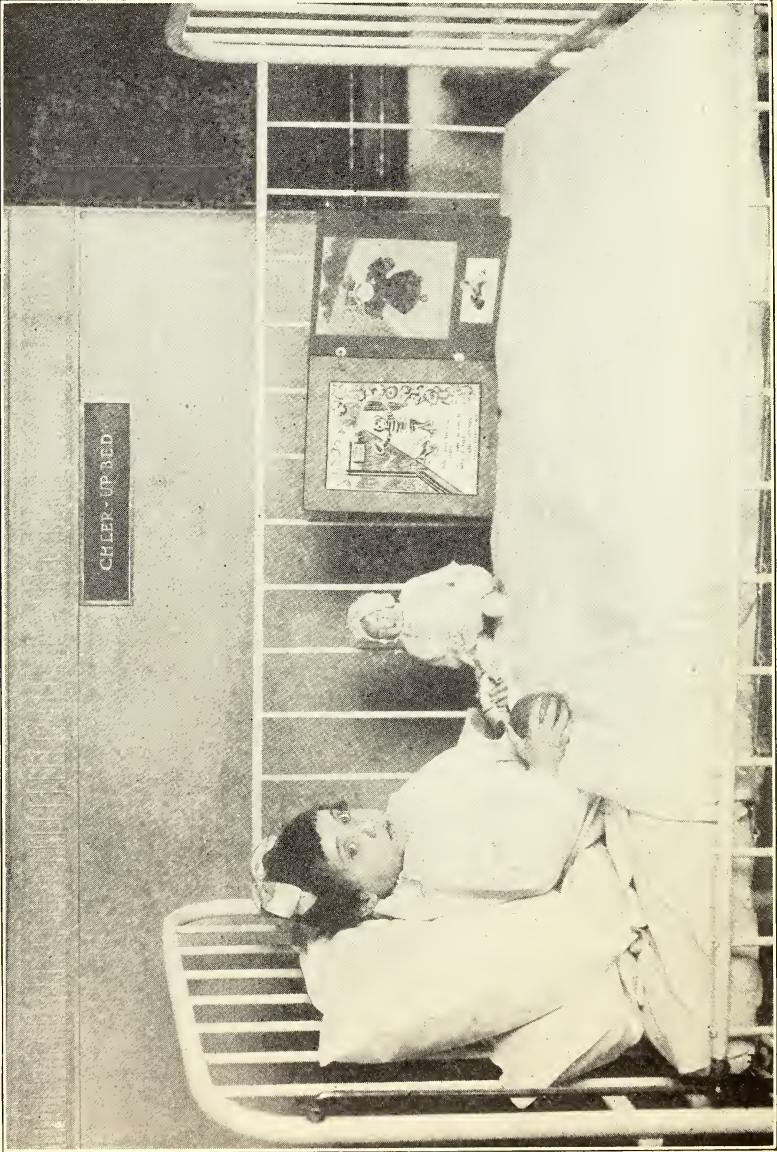
CHEER-UP BED, ENDOWED BY VARIOUS PRESBYTERIAN SUNDAY SCHOOLS. THROUGH THE WOMAN'S AUXILIARY BOARD