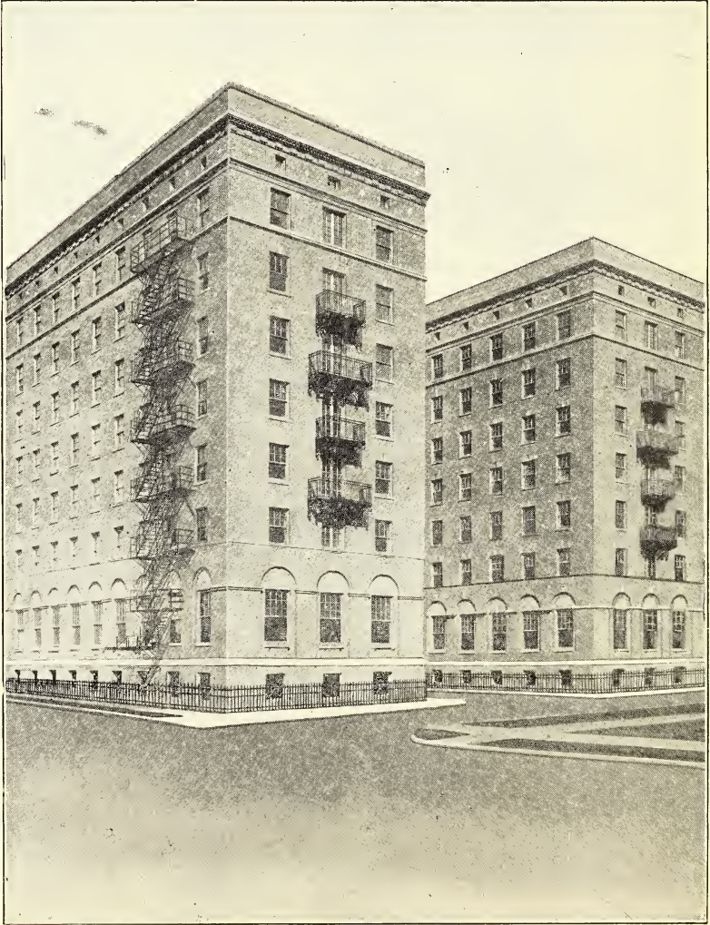
THE SPRAGUE HOME FOR NURSES