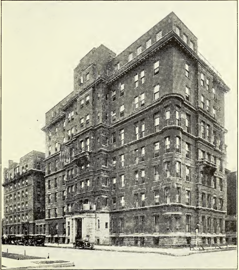
THE JONES MEMORIAL BUILDING