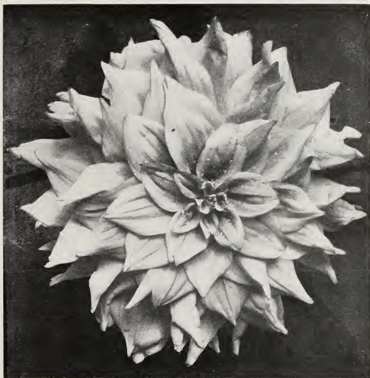
“MAID OF THE MIST”