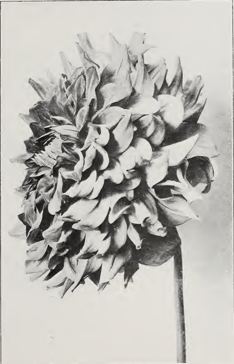
"MAID OF THE MIST" "THE MONARCH"