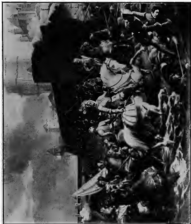
THE DUKE OF GUISE CAPTURES CALAIS. Painting by Picot; Gallery of Versailles.