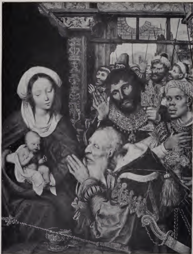
ADORATION OF THE KINGS BY QUENTIN MASSYS