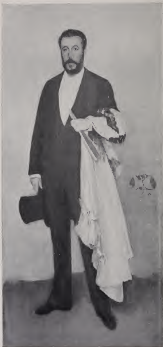
ARRANGEMENT IN FLESH COLOR AND BLACK THÉODORE DURET BY JAMES A. MC NEILL WHISTLER