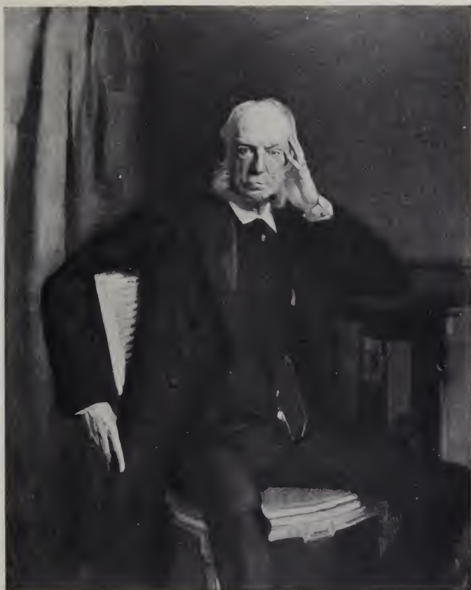
HENRY G. MARQUAND BY JOHN S. SARGENT