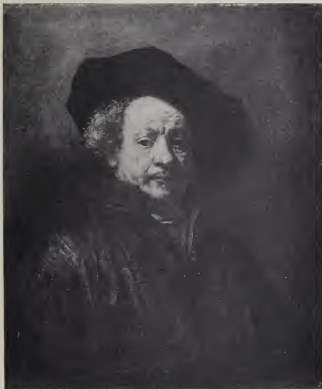
PORTRAIT OF THE ARTIST BY REMBRANDT