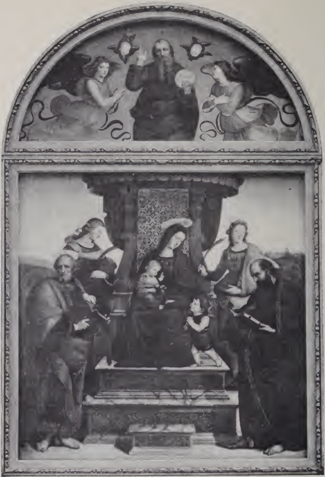
VIRGIN ENTHRONED WITH SAINTS BY RAPHAEL