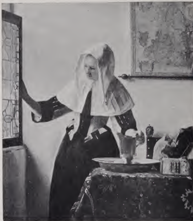
YOUNG WOMAN WITH A WATER JUG BY JOHANNES VERMEER