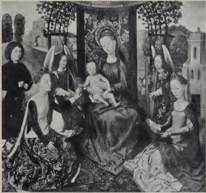
BETROTHAL OF SAINT CATHERINE BY HANS MEMLING