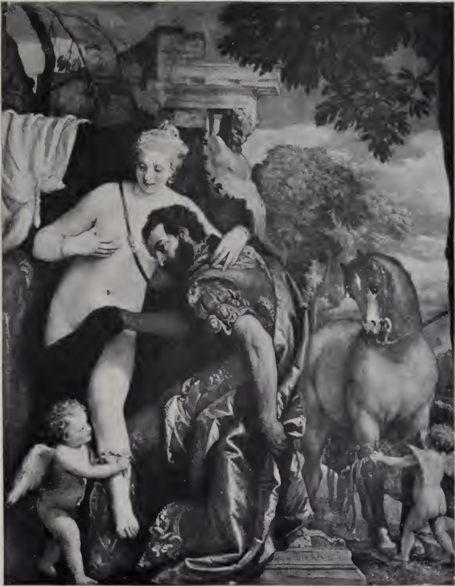
MARS AND VENUS UNITED BY LOVE BY PAOLO VERONESE