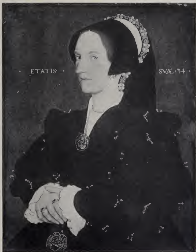
MARGARET WYATT, LADY LEE BY HANS HOLBEIN