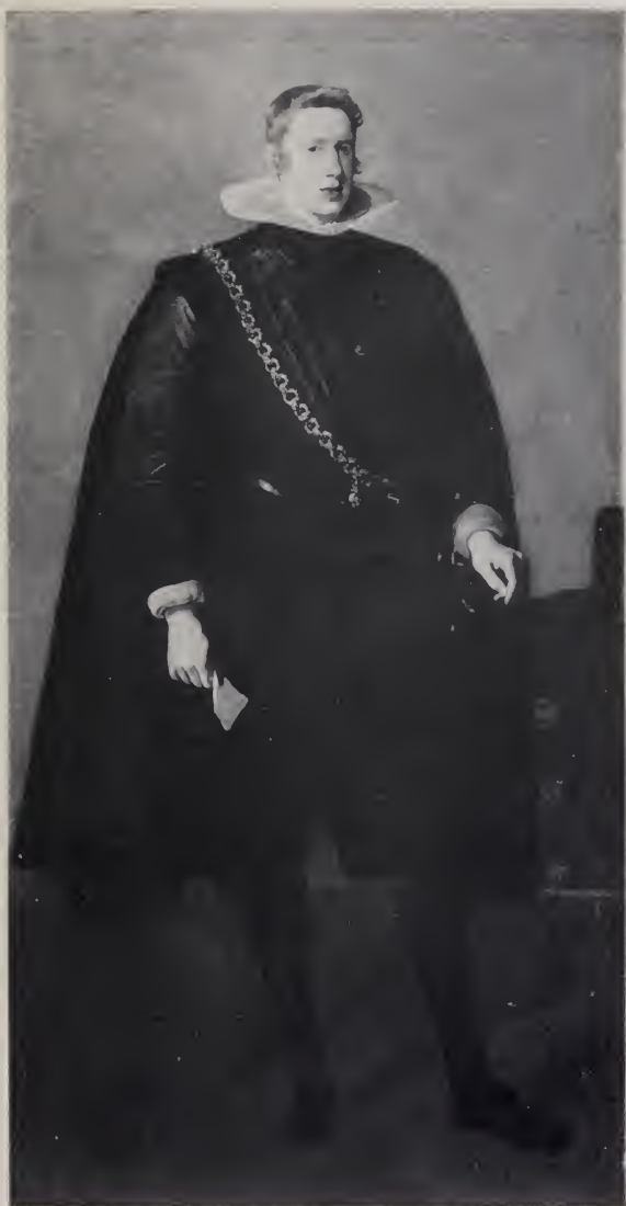
PHILIP IV OF SPAIN BY VELAZQUEZ