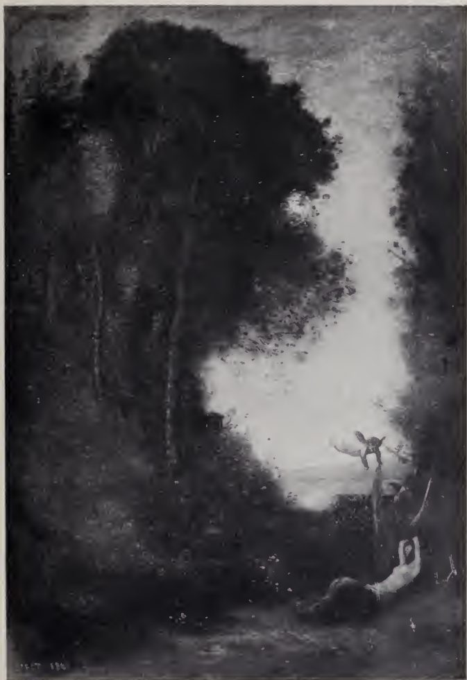
THE SLEEP OF DIANA BY JEAN BAPTISTE CAMILLE COROT