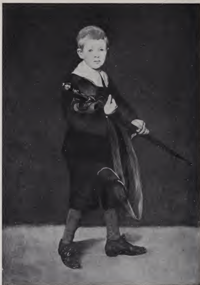
BOY WITH A SWORD BY EDOUARD MANET