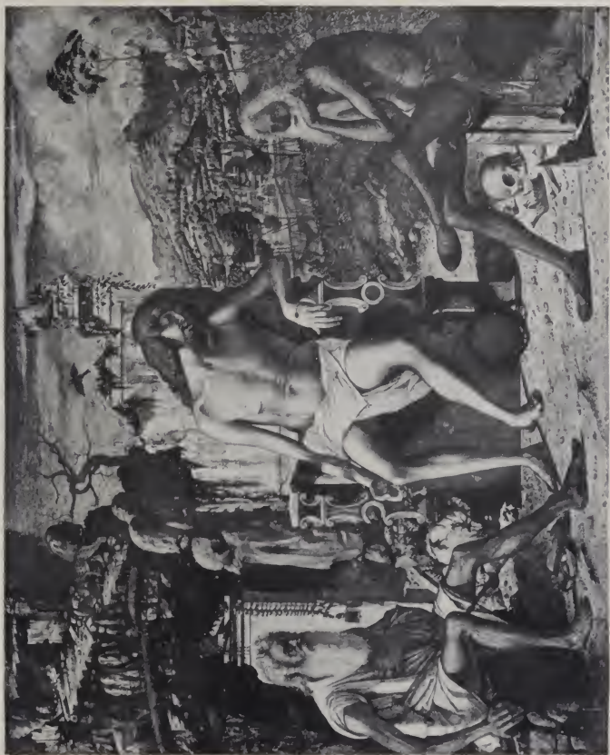
MEDITATION ON THE PASSION BY VITTORE CARPACCIO