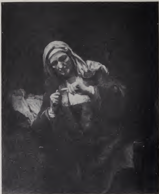
OLD WOMAN CUTTING HER NAILS BY REMBRANDT