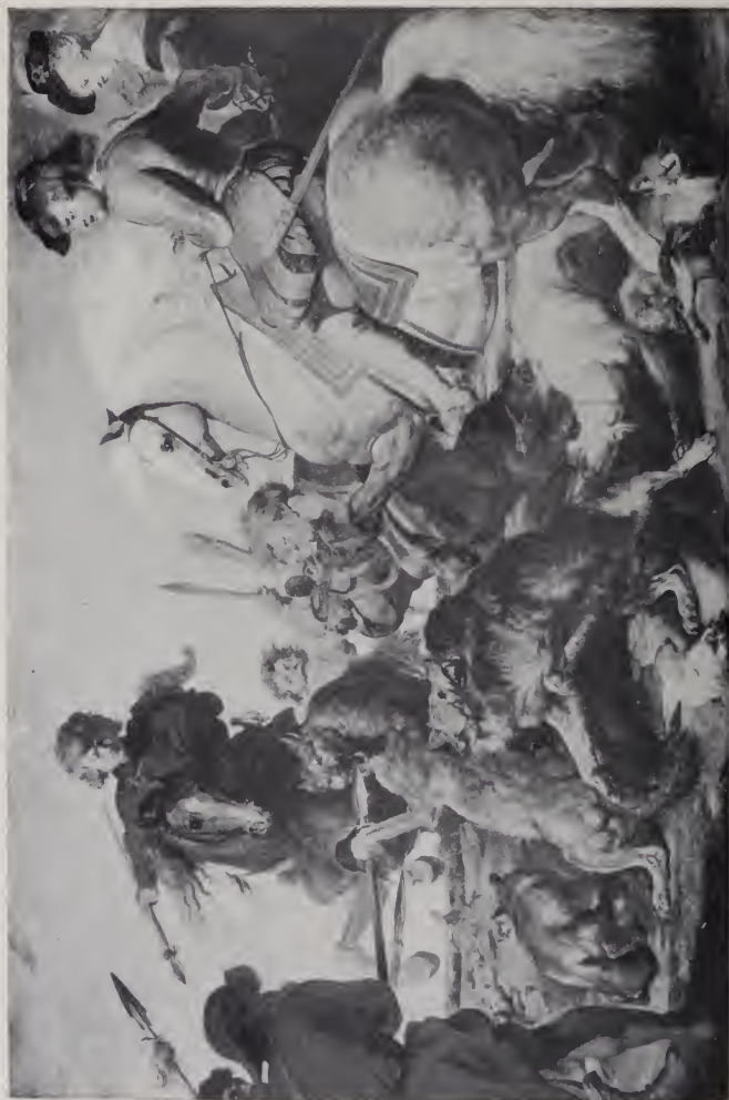
WOLF AND FOX HUNT BY PETER PAUL RUBENS