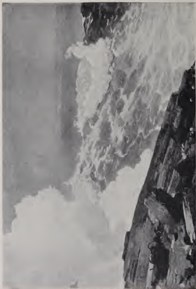
NORTHEASTER BY WINSLOW HOMER