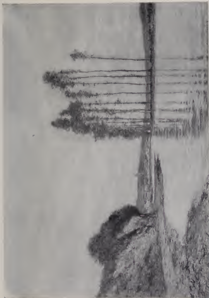
HARP OF THE WINDS: A VIEW ON THE SEINE BY HOMER D. MARTIN