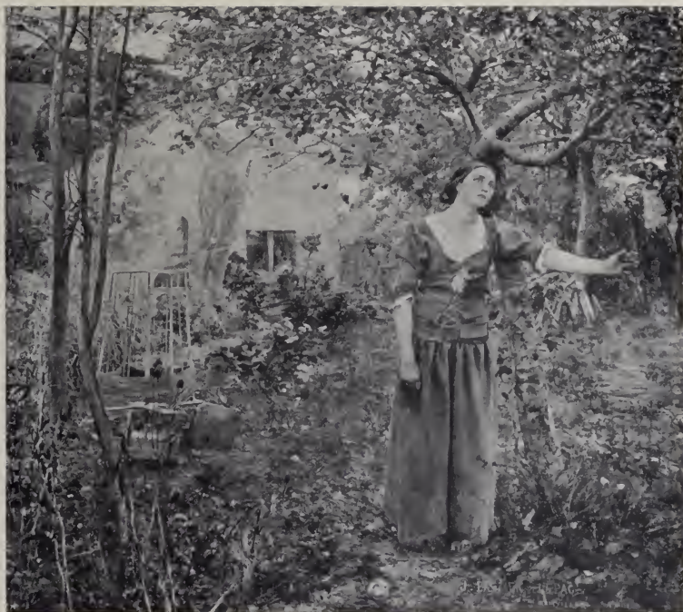
JOAN OF ARC BY JULES BASTIEN-LEPAGE