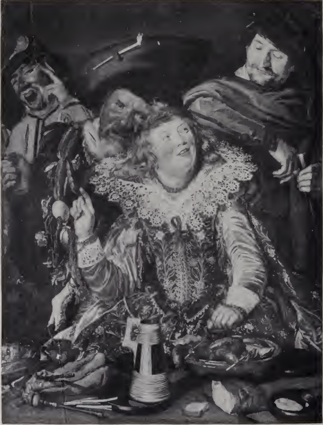
THE MERRY COMPANY BY FRANS HALS