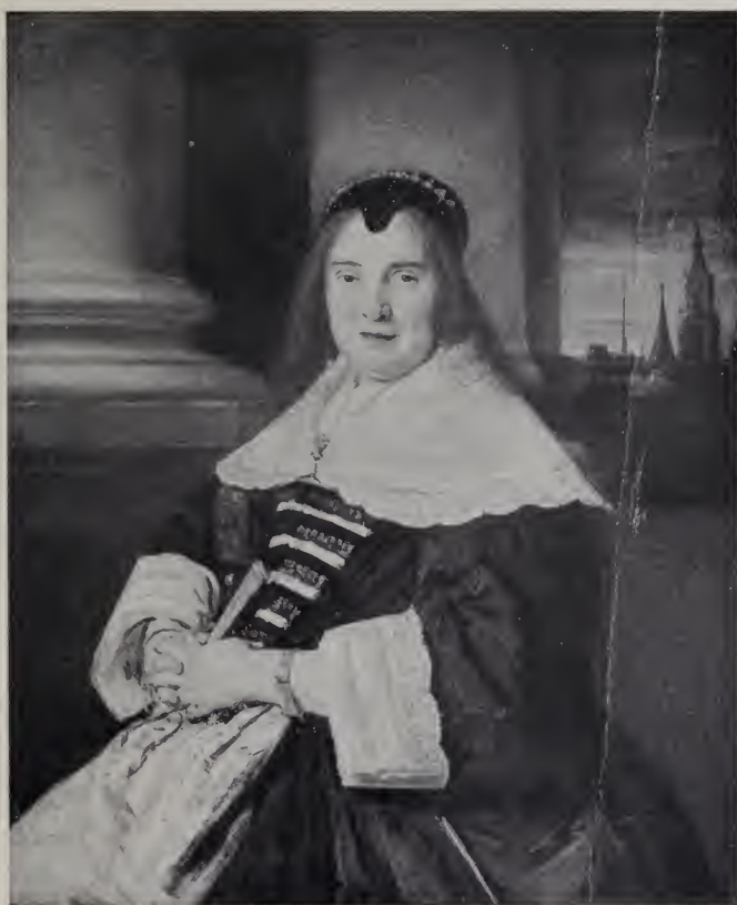
PORTRAIT OF A WOMAN BY FRANS HALS