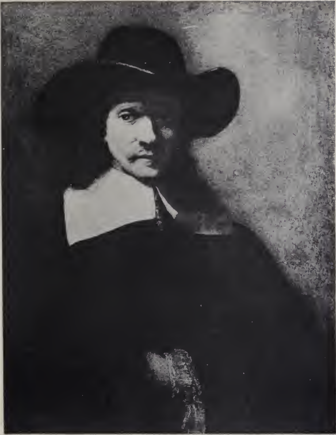
PORTRAIT OF A MAN BY REMBRANDT