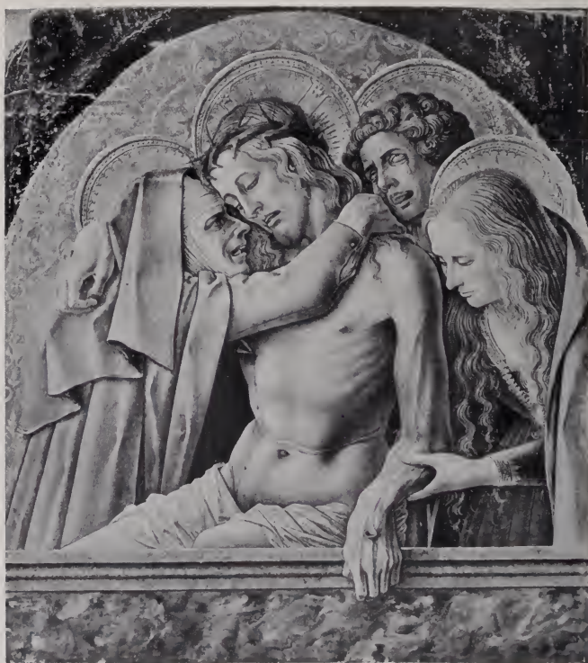
PIETÀ BY CARLO CRIVELLI