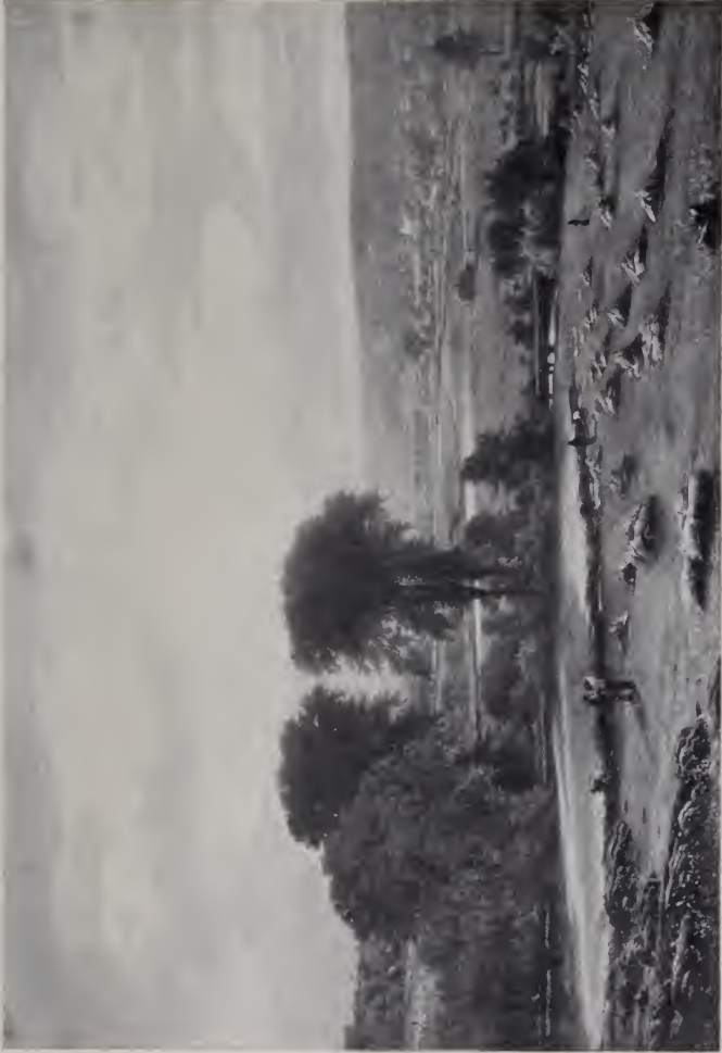
PEACE AND PLENTY BY GEORGE INNESS