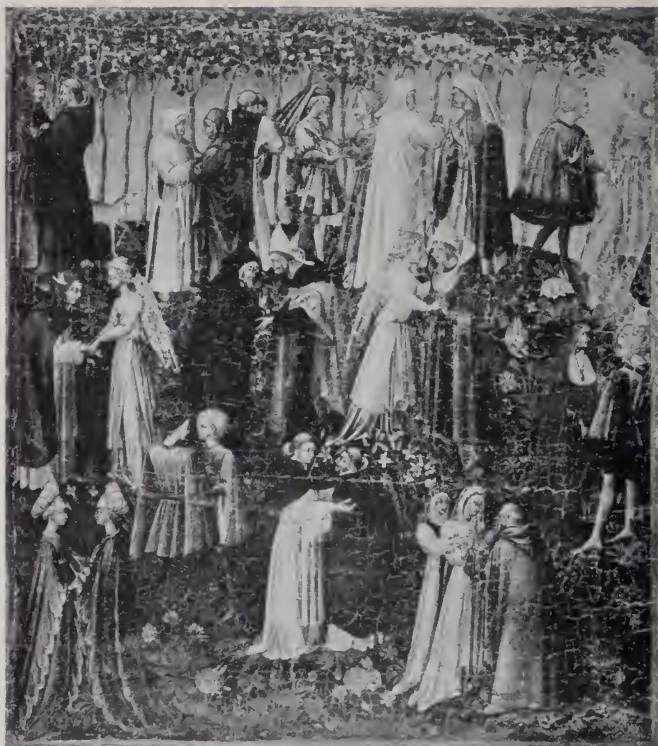
PARADISE BY GIOVANNI DI PAOLO