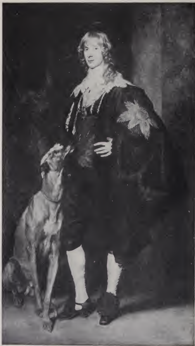
JAMES STUART, DUKE OF LENNOX BY ANTHONY VAN DYCK