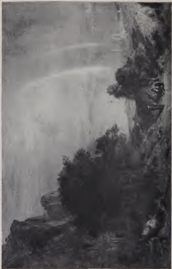
THE AEGEAN SEA BY FREDERIC E. CHURCH