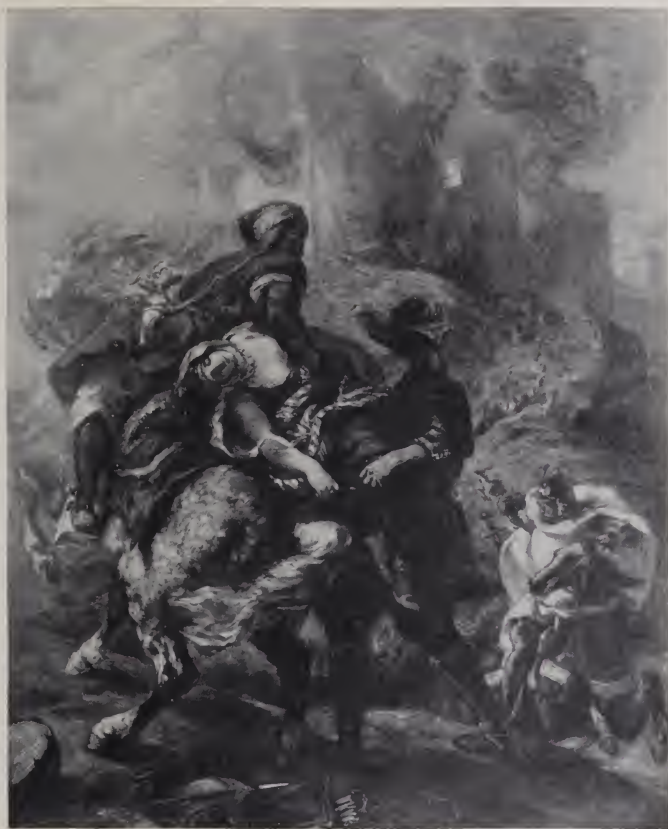
THE ABDUCTION OF REBECCA BY EUGÈNE DELACROIX