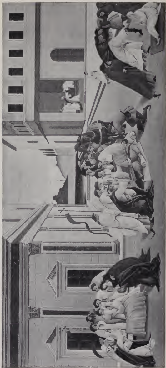
THREE MIRACLES OF SAINT ZENOBIOUS BY BOTTICELLI