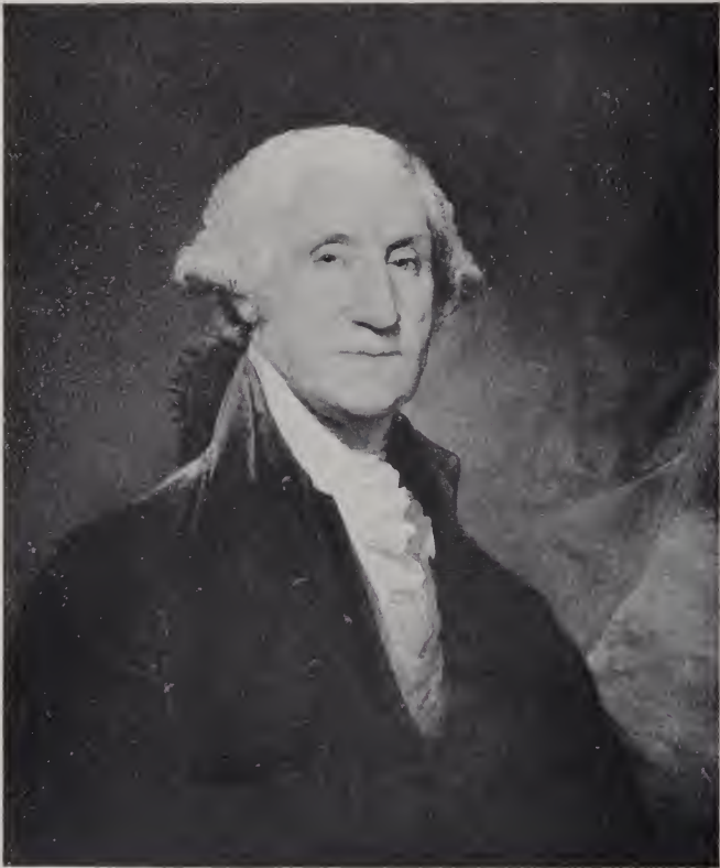
GEORGE WASHINGTON (GIBBS-CHANNING-AVERY PORTRAIT) BY GILBERT STUART