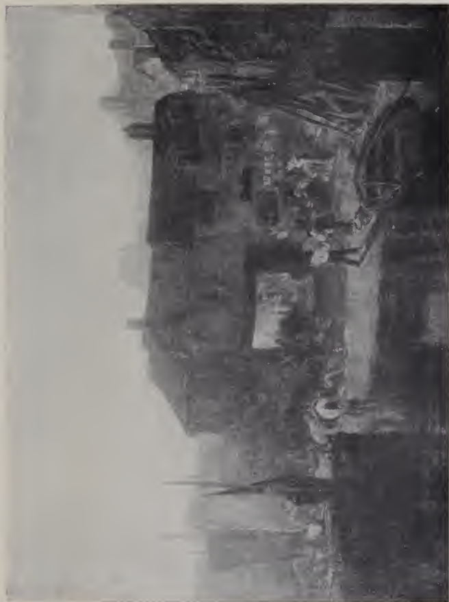
SALTASH BY JOSEPH MALLORD WILLIAM TURNER