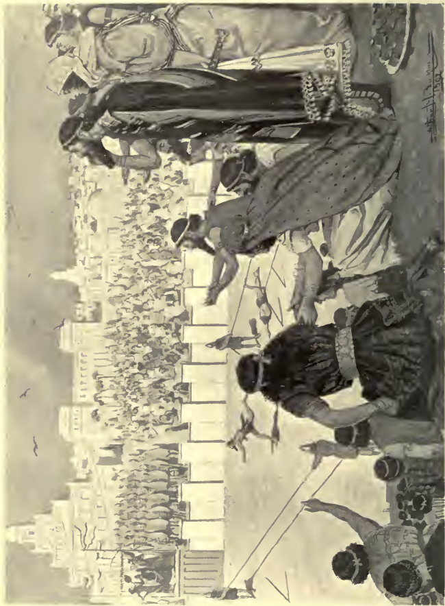
JAIR ROSE FROM THE GROUND LIKE A YOUNG EAGLE