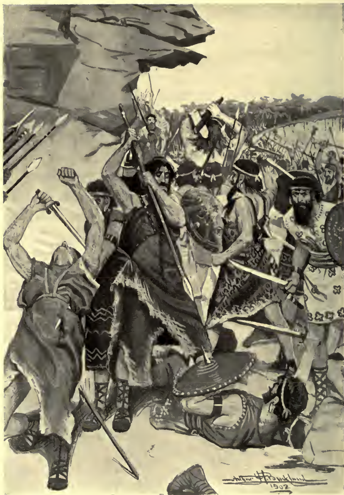
THRUSTING WITH THEIR SPEARS AND HEWING WITH THEIR SWORDS