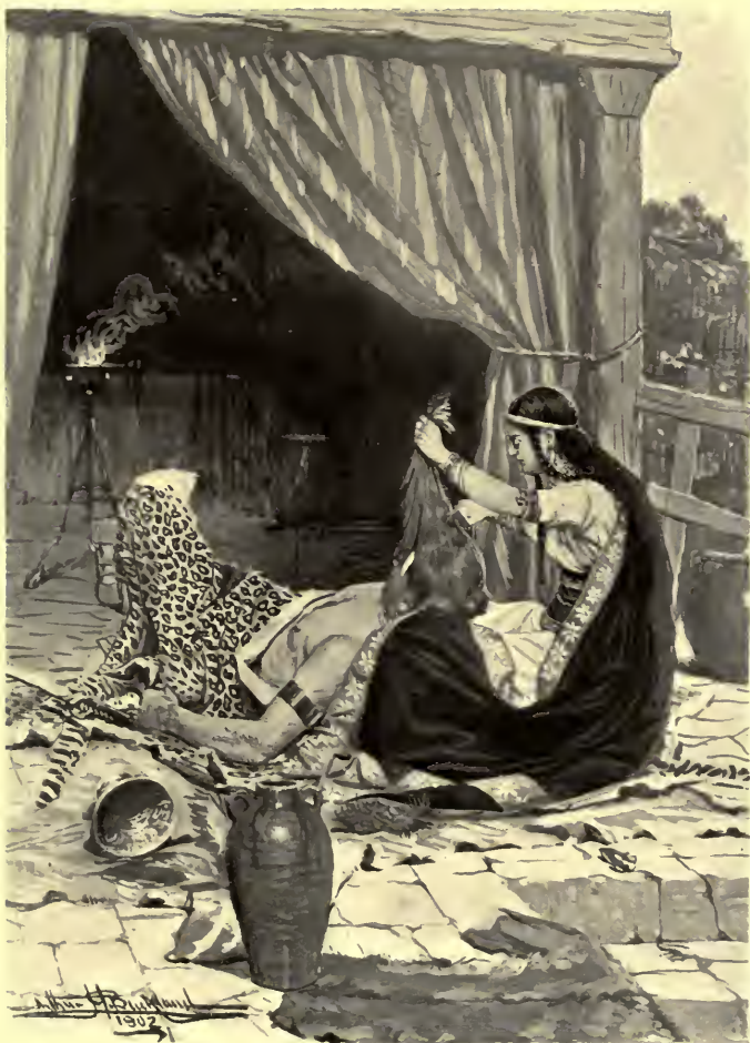
SHE DREW THE BLADE THROUGH THE CURLING HAIR