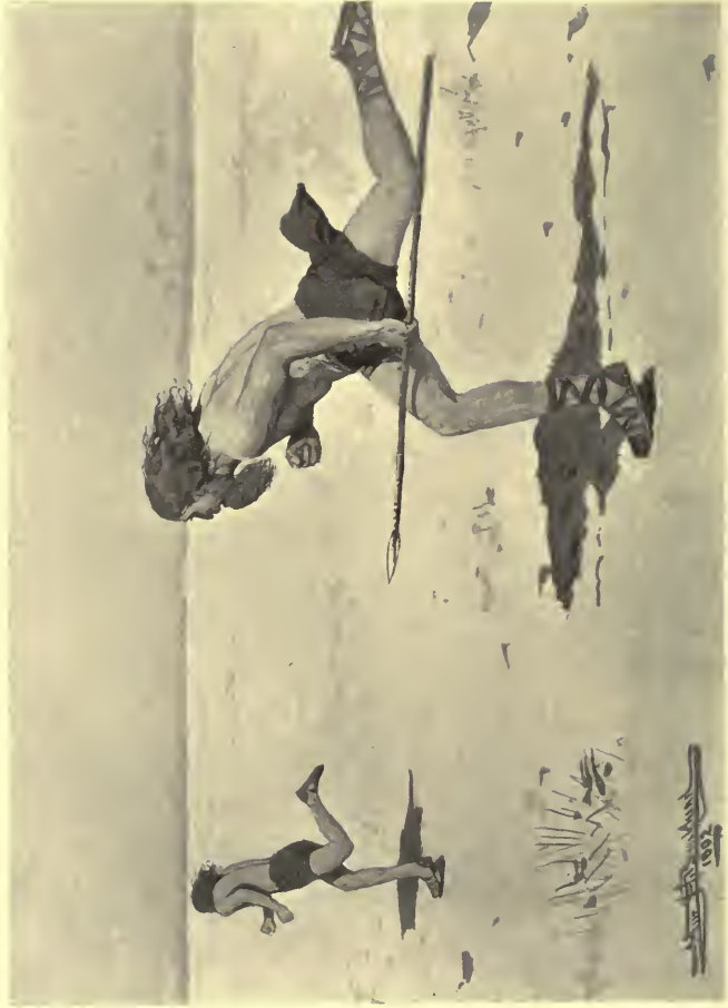
HE KNEW THAT DEATH WAS HUNTING AT HIS HEELS