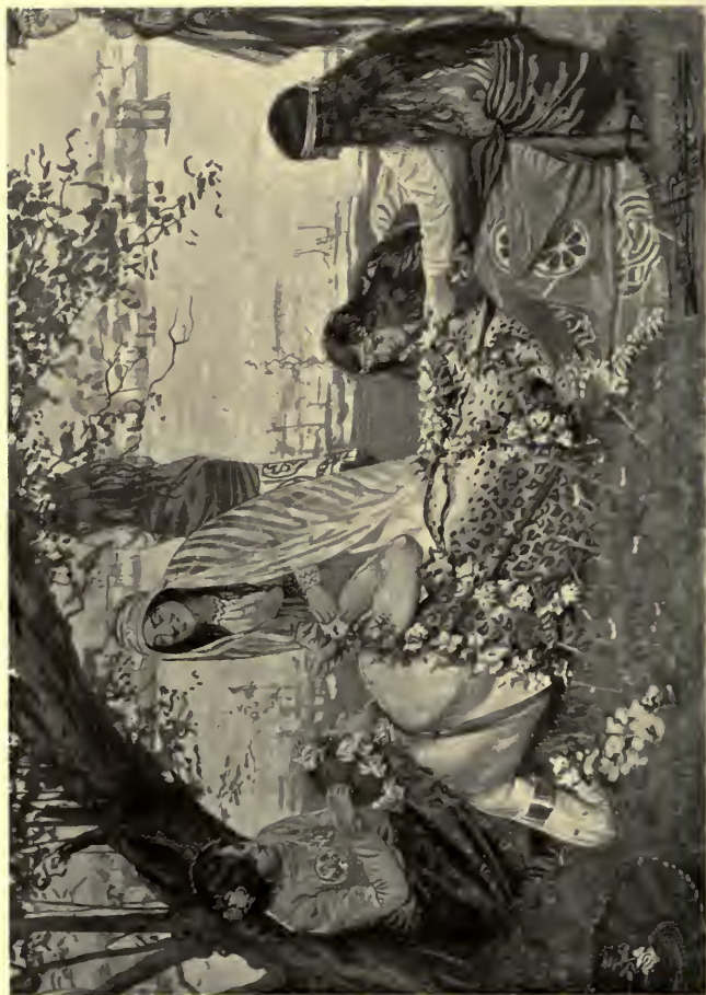
THE GIRLS HAD MADE CHAINS AND FETTERS OF FLOWERS