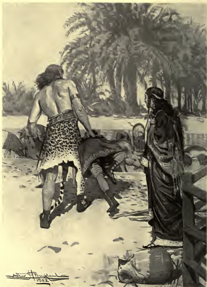
SO SAMSON CARRIED HIM TO A SPOT WHERE A HERD OF SWINE WERE