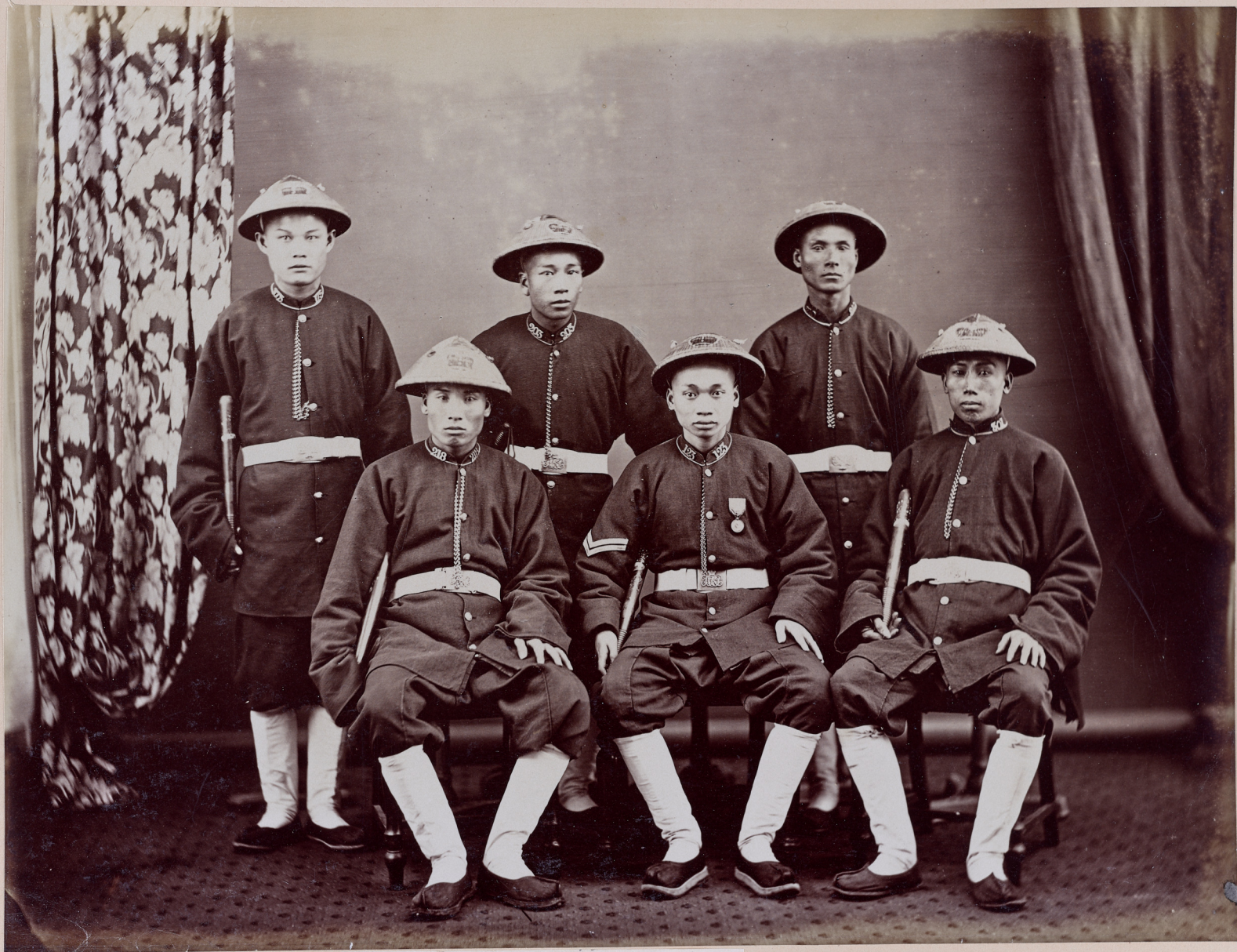
A Group of Hongkong Native Police.