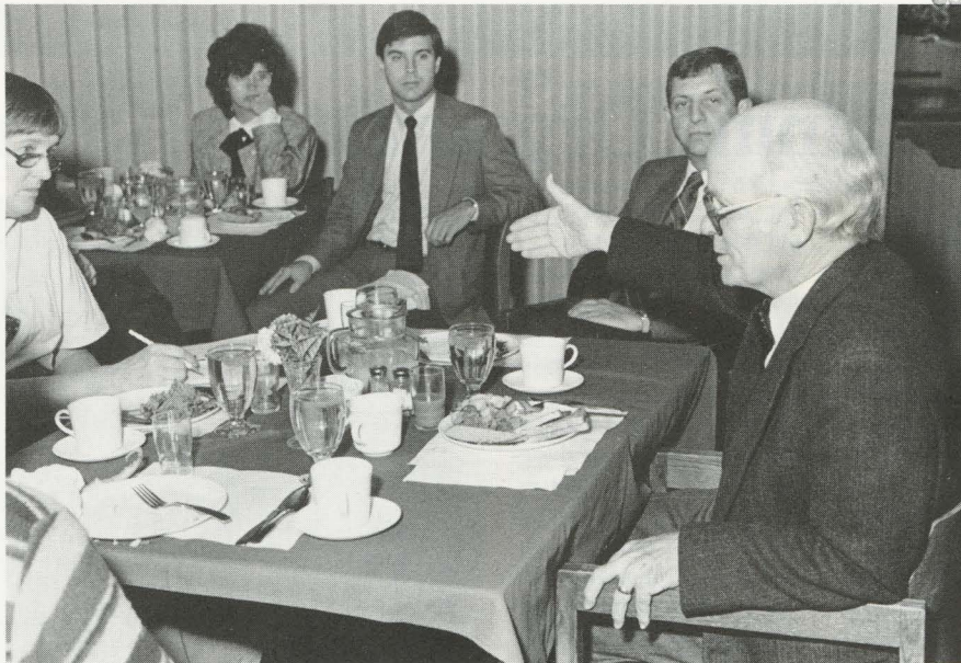
THE BIBLE'S IMPACT ON AMERICA ... Dr. Martin Marty, a theologian from the University of Chicago, led a breakfast discussion about the Bible with students and faculty from the College of Liberal Arts. Marty was a guest speaker in the "America and The Book" lecture series, sponsored by the college and held in conjunction with the 1987-89 Senior Seminar.

Nov. 11 —cancer support group: RIT/CAN Support, featuring film, "People Side of Cancer," noon to 1 p.m., 1829 Room, call -2553.