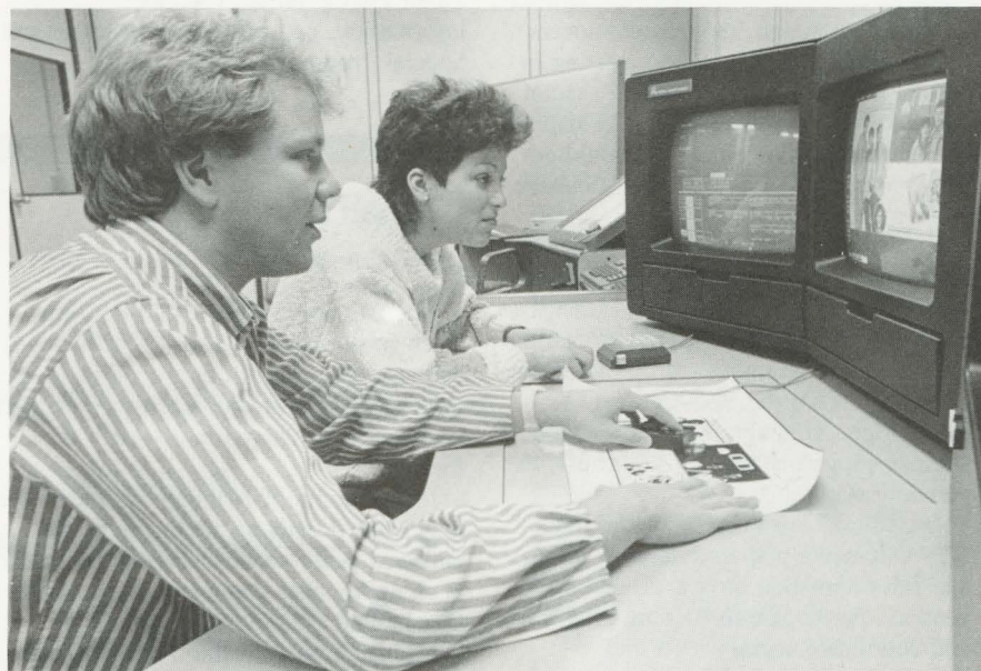
The tools of the printing profession have changed dramatically over the past 50 years. Today students in the School of Printing Management and Sciences use highly sophisticated equipment such as this Scitex electronic color imaging system to assemble 4-color publications, adjust color, and position photographs.

The next day, Nov. 6, the school sponsors its annual Frederic W. Goudy Distinguished Lecture in Typography. This year's lecture, given by digital type design expert Charles Bigelow, will focus