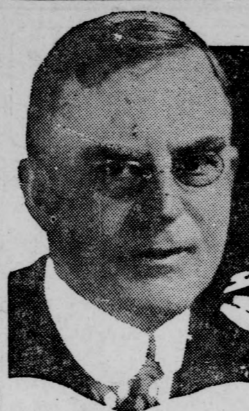
Henry C. Wallace

WASHINGTON, March 31.—For a reason no way connected with the oil scandal, another change is about to occur in the cabinet. Henry C. Wallace, secretary of agriculture, is on the verge of resigning because of a difference with President Calvin Coolidge.