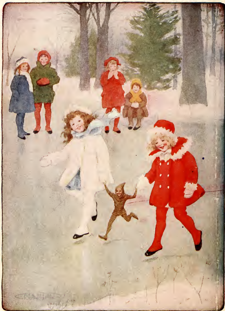
IT WAS MORE LIKE FLOATING THAN RUNNING