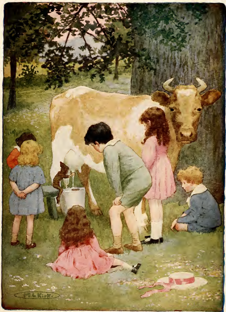
HE PLACED HIMSELF ON THE MILKING STOOL AND MILKED AND MILKED