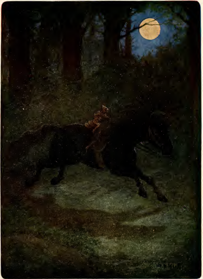
GALLOPING LIKE THE WIND