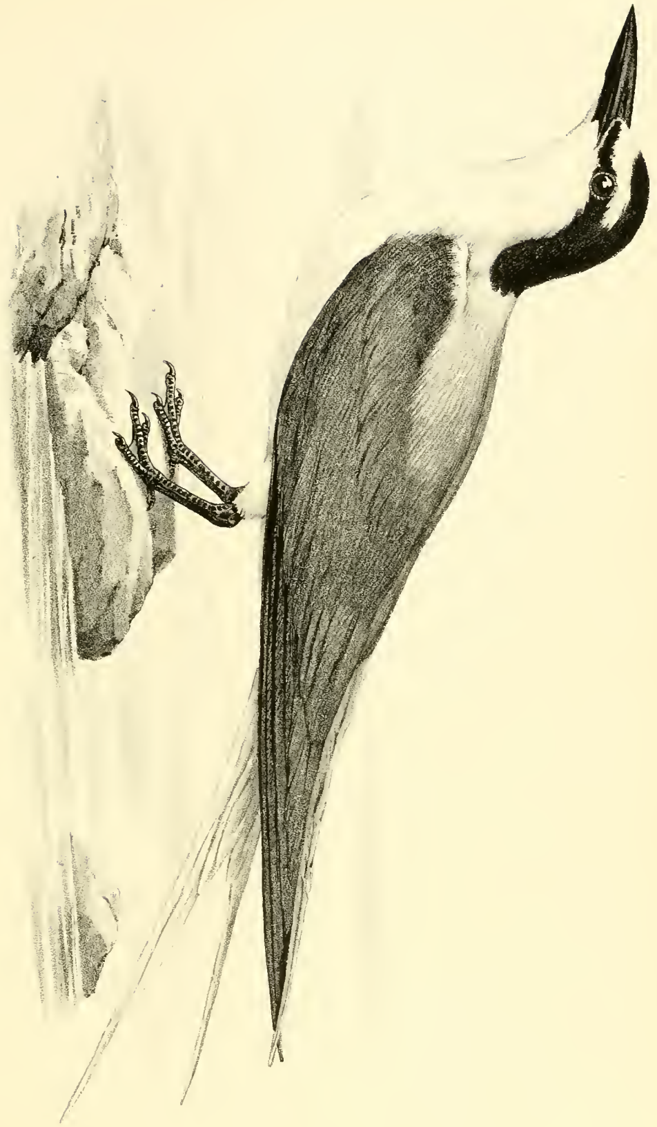
STERNA ANOSTHAETA Sw. Pl. 1 Tern.