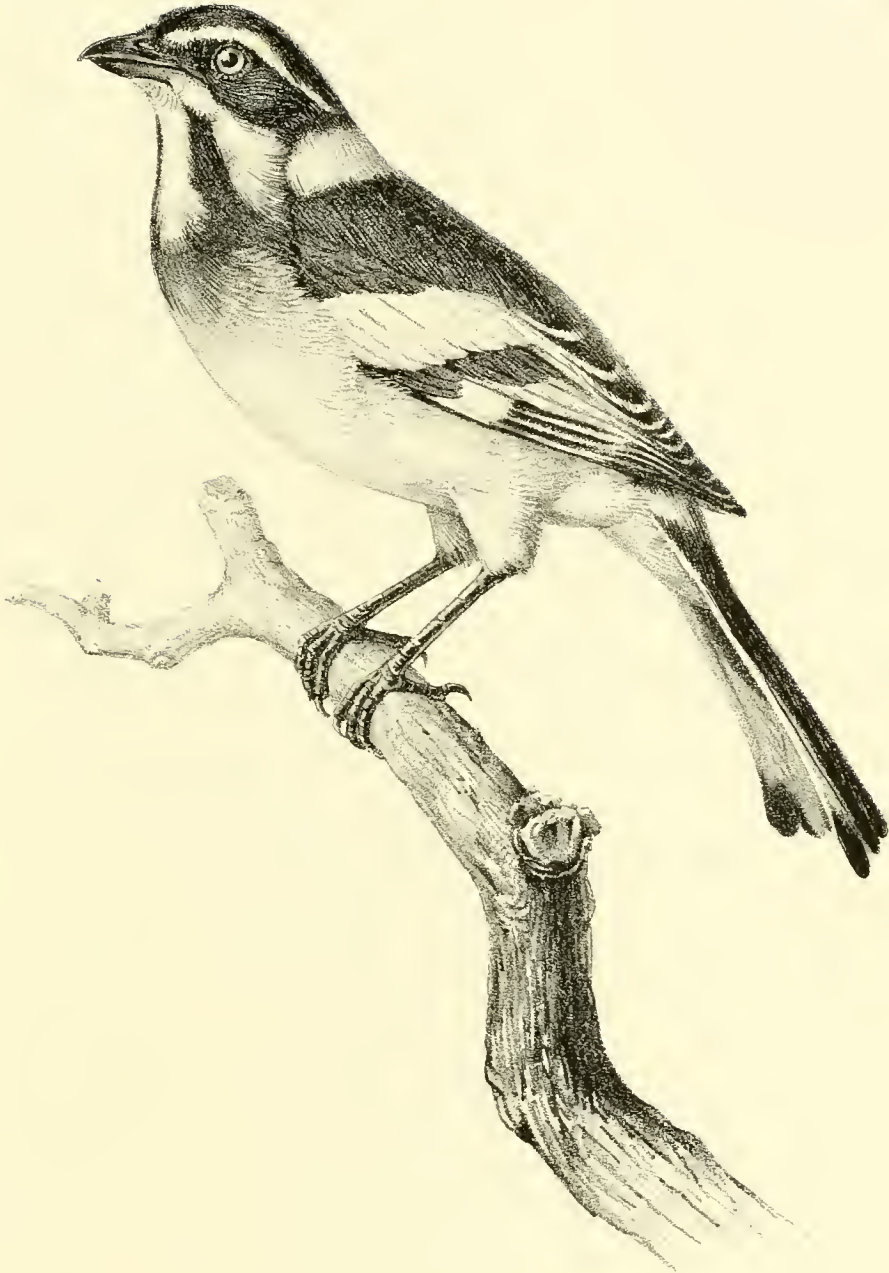
SPINDALIC TERN. Spindalio terna