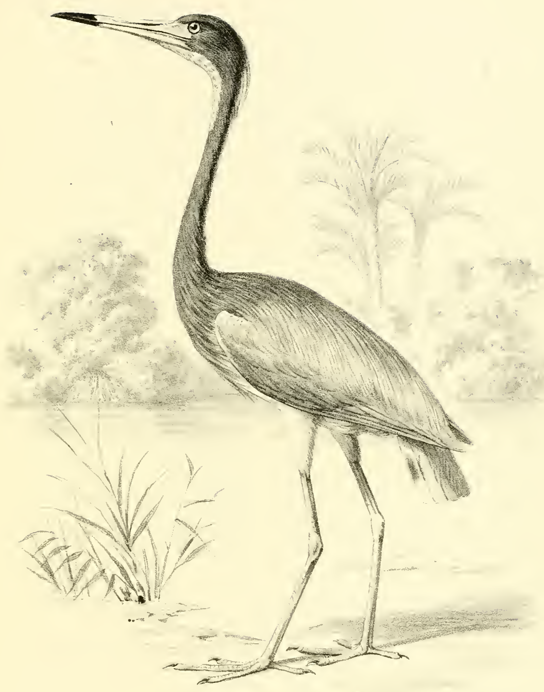
ARDEA HERODIAS, L. Great Egret