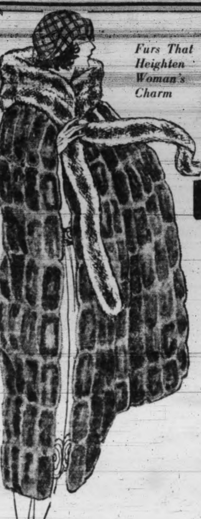
Furs That Heighten Woman's Charm