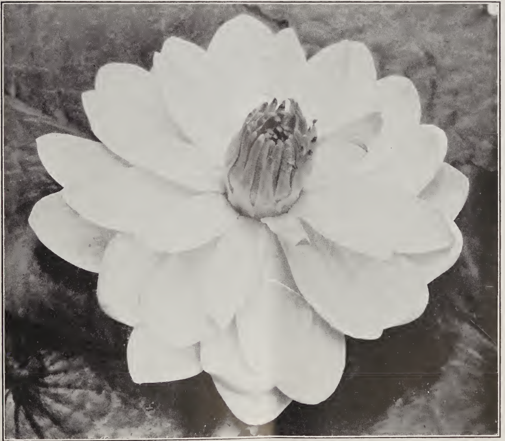
White Night Bloomer (Missouri)

An old favorite. A light pink, fading to white at the center of the petals. This gives it the effect of a white stripe in the center of each petal. Blossoms are large and borne freely. Pads are light bronze in color .....$1.50