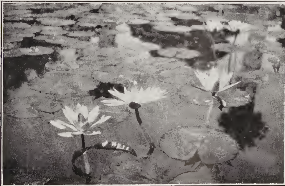
Devonese (Dark rose night bloomer)

We have selected what we think are the best in each color and are listing those, as it is almost impossible to list them all.