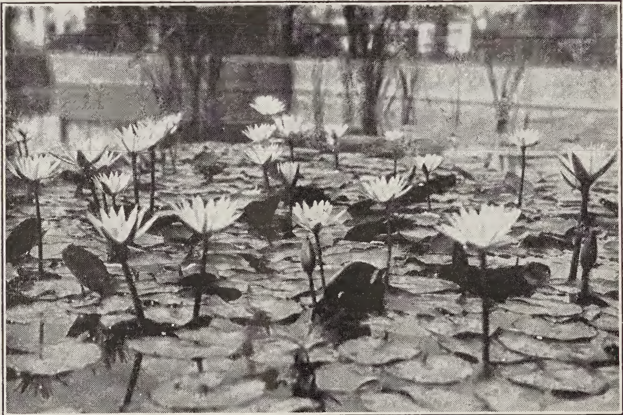
Tropical Star Lilies give a profusion of bloom

Early orders of Star Lilies are sent as started tubers, later they are sent as plants.