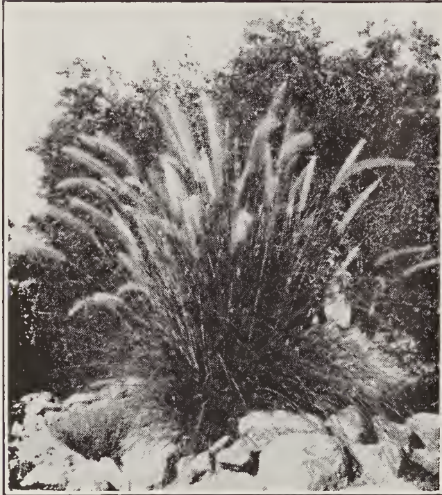
Hardy Fountain Grass

Chinese Water Chestnut. Grows stems somewhat like porcupine rushes, about twelve inches high. In the Fall it makes small bulbs, something in appearance to medium sized Gladiolus bulbs. Needs shallow water. These bulbs are used very much as an article of diet by the Chinese. Each.....$.20