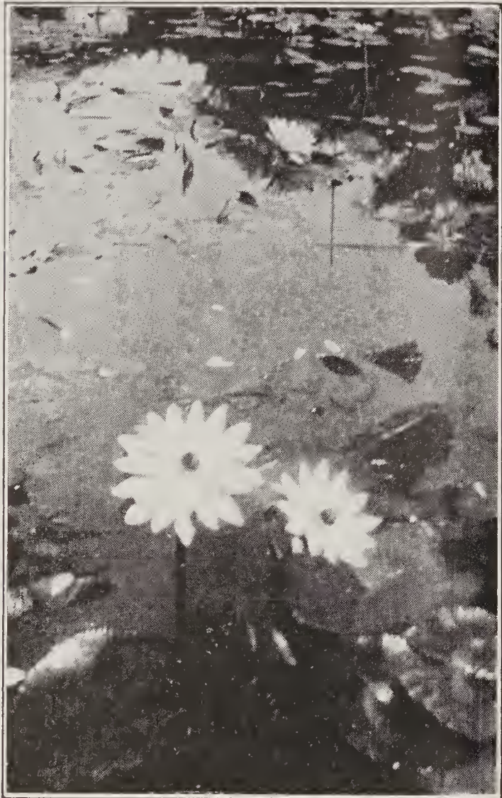
H. C. Haarstick, best dark red night bloomer

are often ten inches across. The pads are dark red or mahogany. Stamens are tipped with mahogany.....$1.75