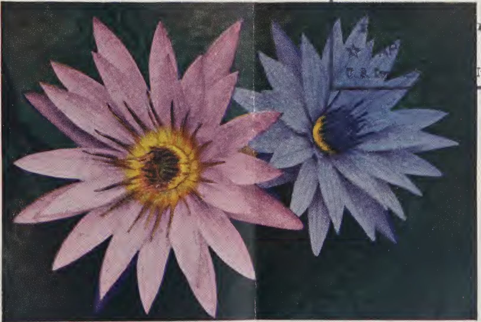
ROSE STAR AND PURPLE STAR

2240 Sierra Way, San Bernardino, California