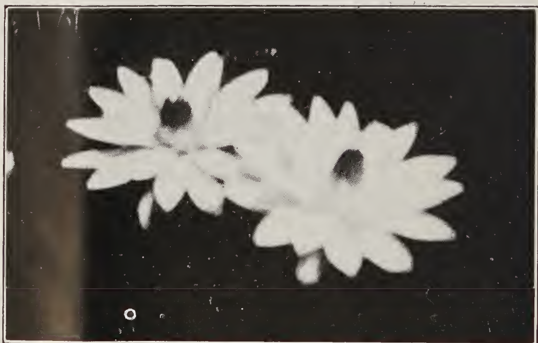
Dawn, developed and introduced by us in 1928, the best pearl.

The best of the white night blooming varieties. A giant for bloom and leaf spread. Postpaid .....$2.50