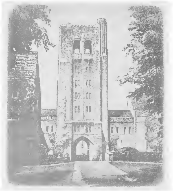
Cornell Law School Library