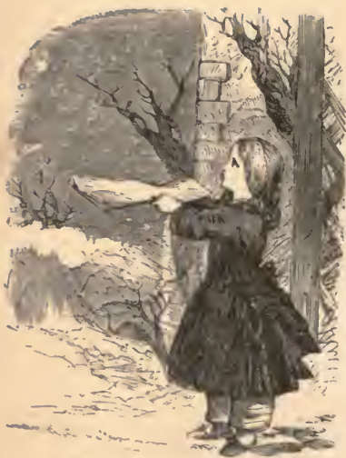
Winnie catching the Snow-flakes.