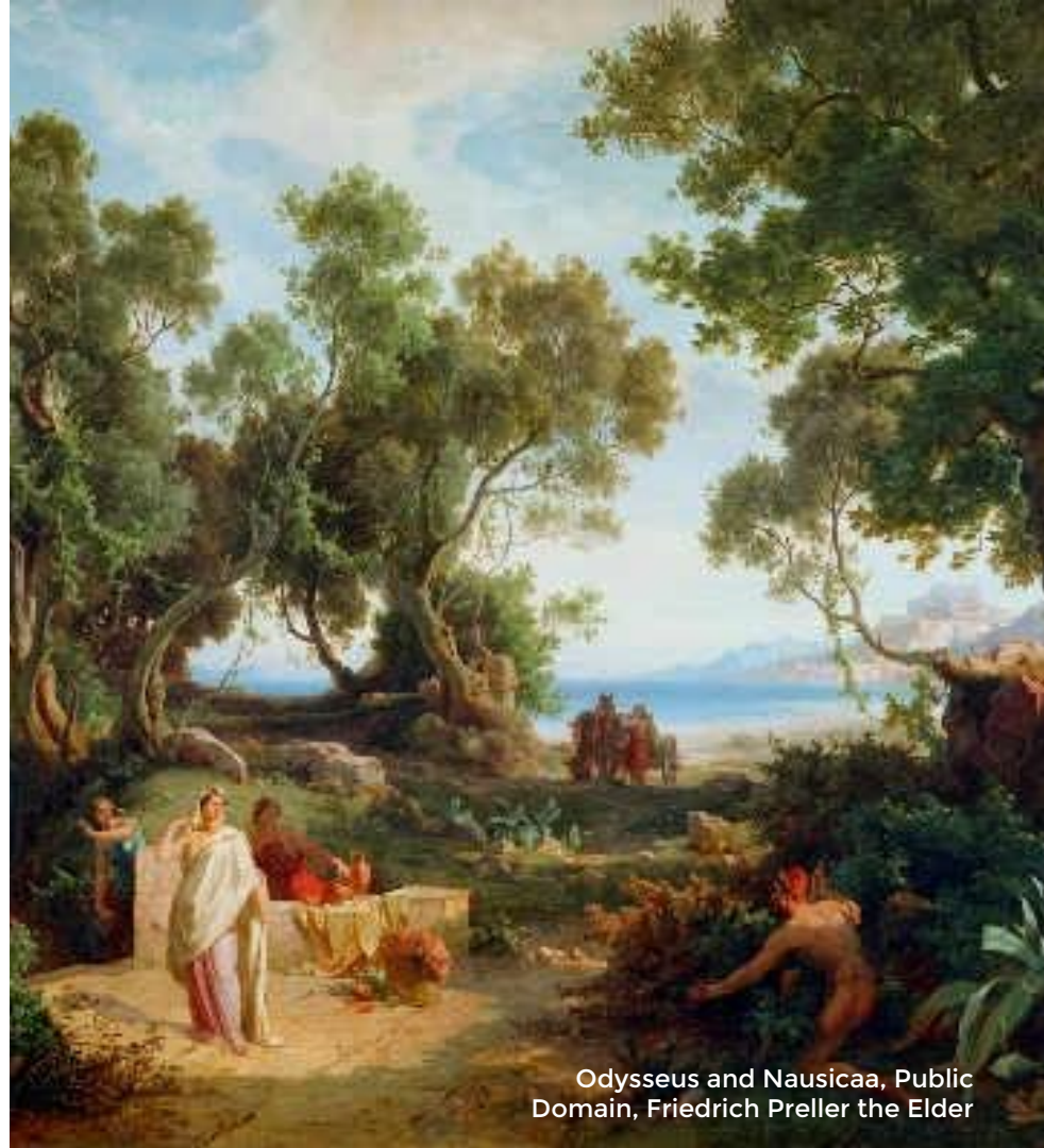
Odysseus and Nausicaa, Public Domain, Friedrich Preller the Elder