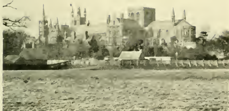
THE CATHEDRAL FROM THE S.E.

E ACH one of our English cathedrals has its own particular charm. At Canterbury, Winchester, and St. Albans it is historic; at Peterborough it is mainly architectural. Sir Gilbert Scott wrote that after Durham, Peterborough was the finest Norman interior that we have. After Durham certainly in grandeur, but surpassing the northern cathedral in at least one point, the Norman east end, a feature that we find in only one other cathedral—Norwich. But if Durham be grander in its Norman work, Peterborough stands unrivalled in its west front—the very finest in Europe: and probably the most beautiful object of all architectural art in England. If this be granted, and if we can also accept Froude's dictum that "The Gothic cathedral is, perhaps, on the whole, the most magnificent creation which the mind of man has as yet thrown out" then this front is indeed precious.