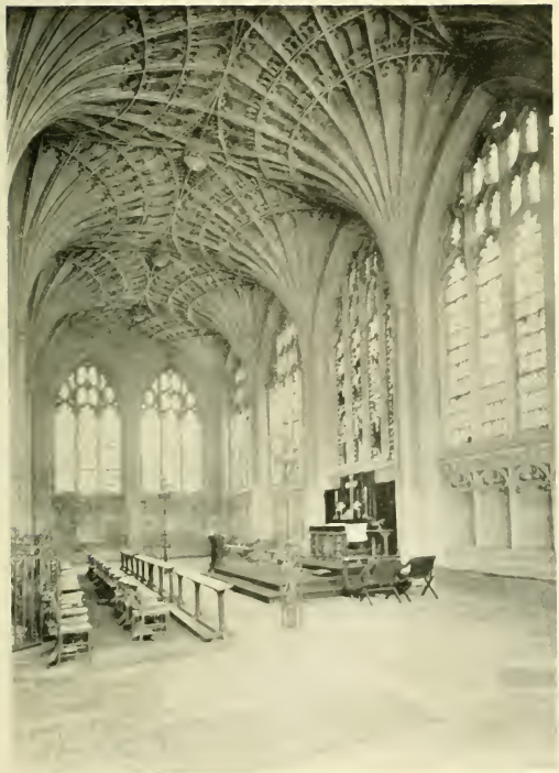
THE NEW BUILDING.