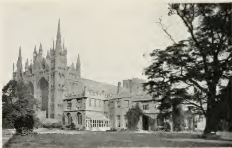
THE CATHEDRAL AND BISHOP'S PALACE