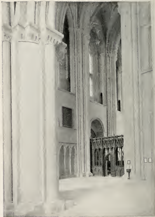
THE WEST TRANSEPT.