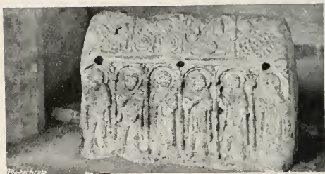
THE MONKS' STONE.