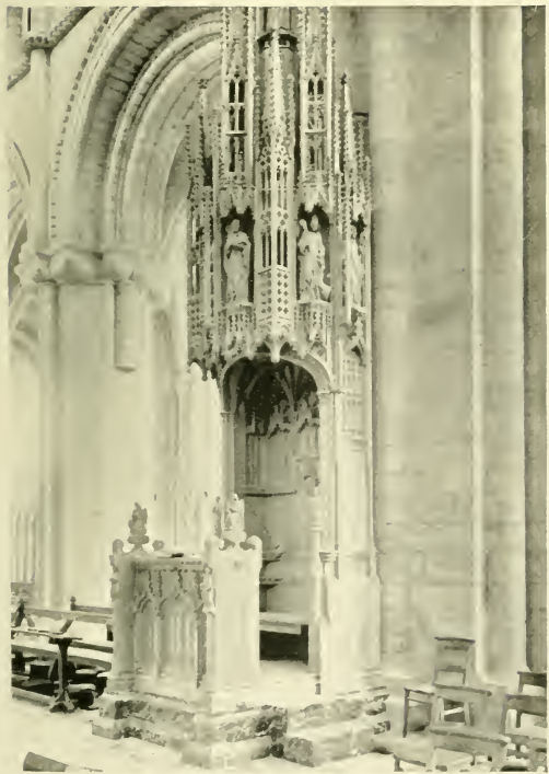
THE BISHOP'S THRONE.