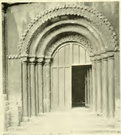
THE SOUTH PORCH.